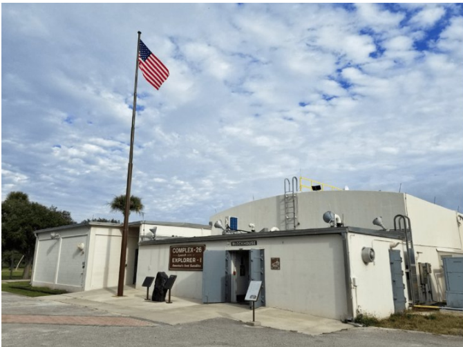
Air Force Space & Missile Museum