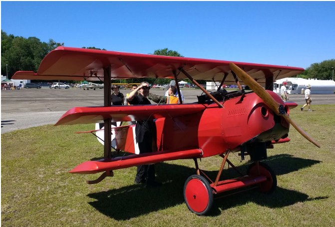
3/4 Scale Fokker Triplane at Cross City