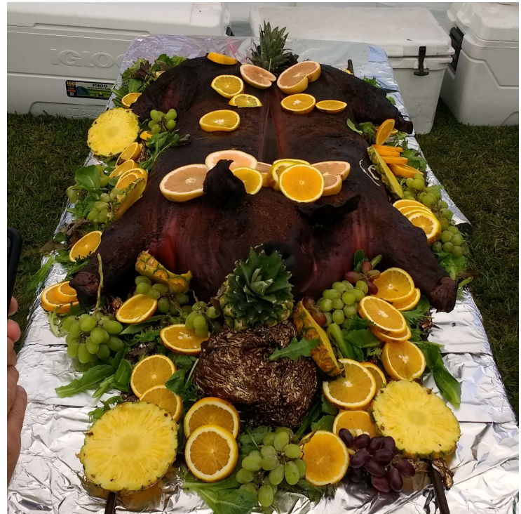
Kinda dark to see, the pig was dressed to kill.

There were a few parachutists that dropped in a couple of times. Helicopters hovering about contrary to the current pattern, a Cessna 421 on the deck at 160+ mph and an LSA that took off down the middle of aircraft parking really kept your head on a swivel. These guys are a relaxed and fun bunch.