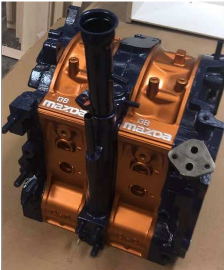
Mazda 2 Rotor, Rotary Engine

A Pancake Breakfast will be at 8:00 AM. All of our members are asked to share in the fun.