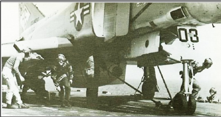
Catapult hookup crew