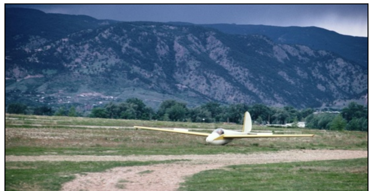
Schweizer 1-2C, 1970