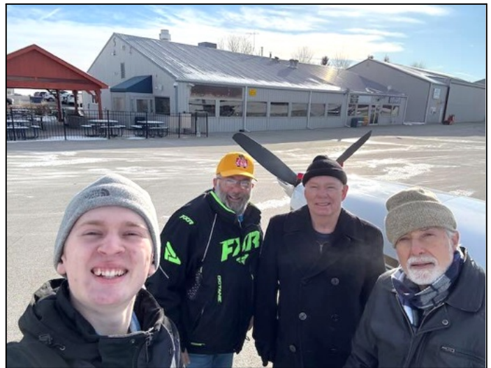
We traveled by plane, helicopter, and car to sample the food at Charlie's Restaurant.