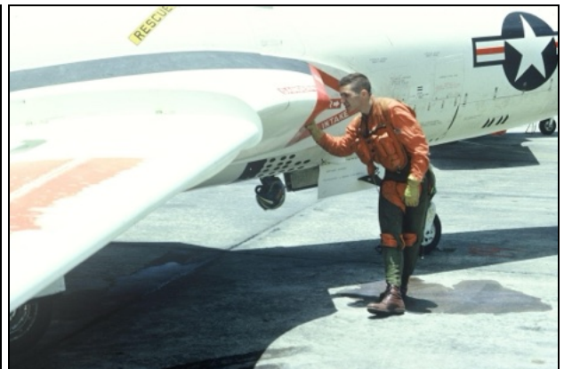
Pre-flighting a TF-9J Cougar, 1966