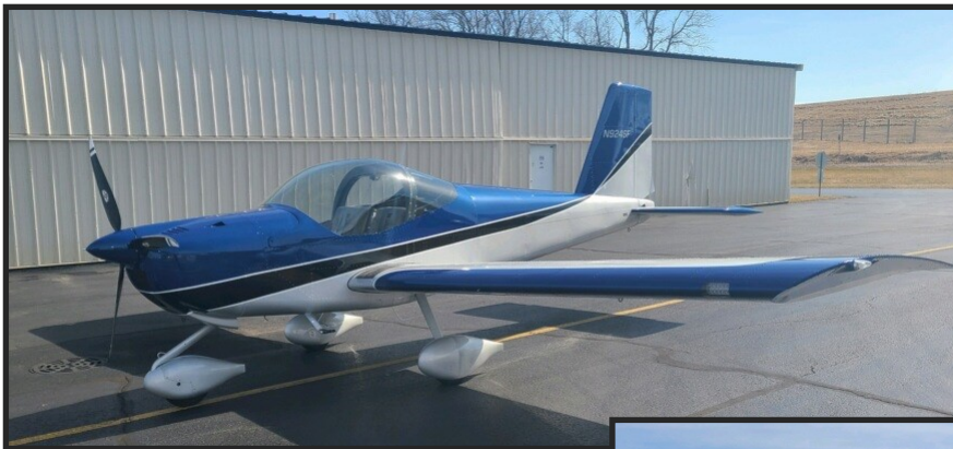
Back at Home Base!