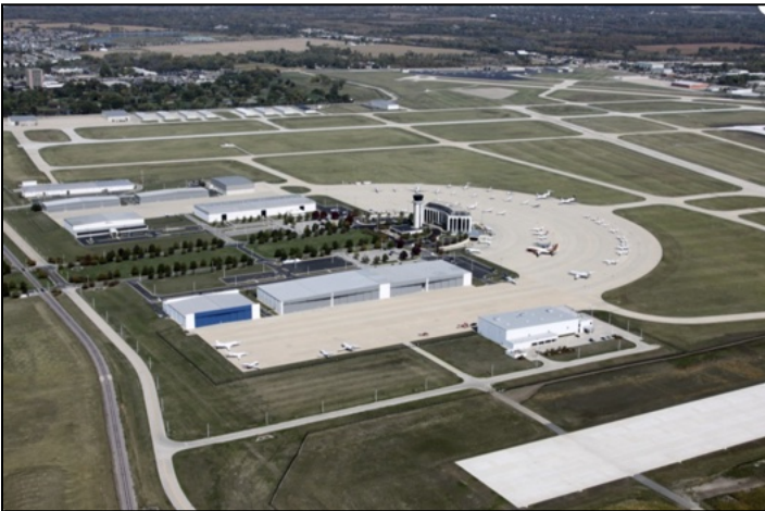
DuPage, as seen from the southwest

DuPage Tower has a monthly Safety & Outreach Newsletter , published by the DuPage National Air Traffic Controllers Association (NATCA) Pilot Outreach team. Topics include traffic statistics, information about safe flight operations, local procedure changes, profiles of controllers, and an invitation to have “coffee with the controllers” from 09:00-11:00 on the first Saturday of every month. Each newsletter contains links to view previously newsletters, subscribe, request a tour of the tower, and to contact the Pilot Outreach team.