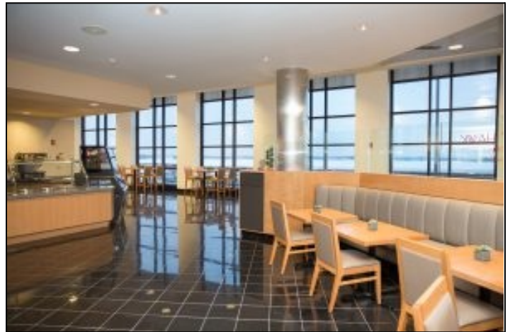
Kitty Hawk Cafe