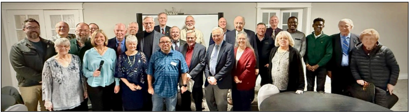
Attendees enjoyed the evening. We'll do it again next year!