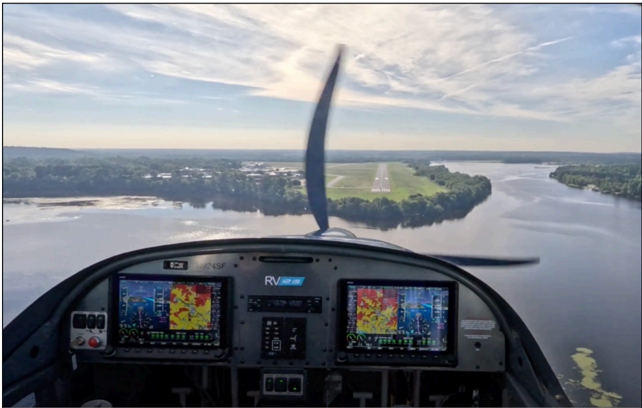
The 1st part of the flight was to Wausau (KAUW) for fuel on the way to Madeline Island (4R5)

I borrowed one of the airport bicycles and pedaled my way into town for a BLT sandwich and an ice tea. The restaurant was directly across from the ferry pier, which was kinda cool. I walked around a while and then worked my way back to the airport. The winds had picked up considerably, but my trusty steed (Van's RV12iS) handled the takeoff with its normal aplomb. Heading home, I bypassed Wausau and instead stopped by Hartford (KHXF), where I topped off with fuel and then flew directly back to Galt. It was a wonderful trip – 6.9 hours on the Hobbs.