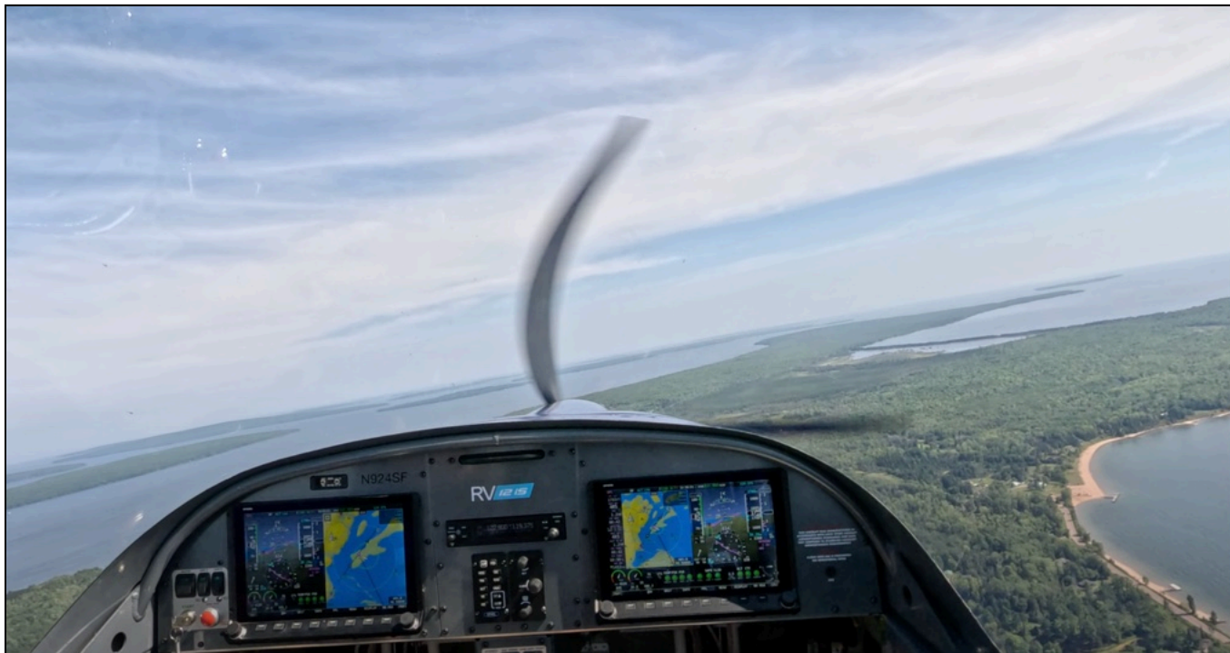
The 2nd half of the flight was from Wausau to Madeline Island (click captions for video)