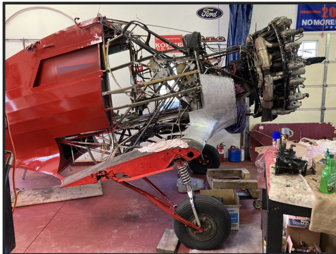
Beech Staggerwing Refurbishment