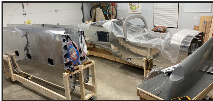
RV-14A Ready for Shipment to Aurora Airport