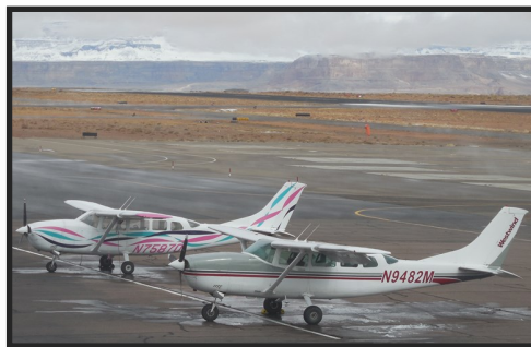
Cessna 207s in Arizona waiting to be coaxed into the air

Brad made it over the top of the Alaska flying learning curve, so it was unknowingly time for another one. Next up were lessons in density altitude, coaxing underpowered airplanes into the air in Arizona. Toss in a few "one way in, one way out" airports as well as a 20 foot wide runway at Marble Canyon to further the challenges.