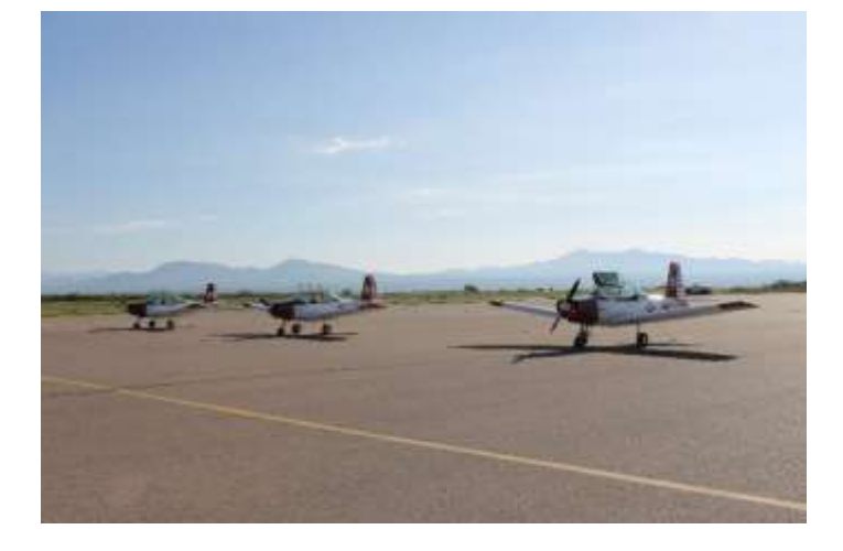
A Flock of Rare Birds @ E95