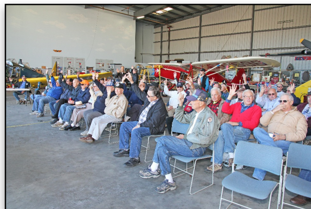
The members approved increasing the Chapter dues from $20 to $25 per year