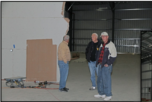
This must be it?