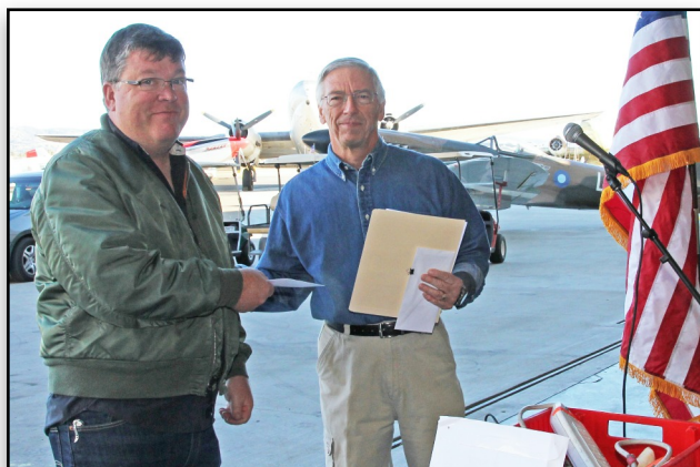
Chapter 723 received a check for $15,000 from CWA as it's share of the WOC air show proceeds