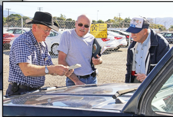
How many pilots does it take, to deliver a Bushcaddy ELSA?