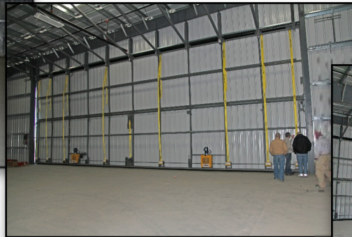
The hangar door