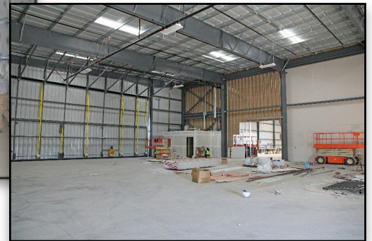
The restroom – Way over there!