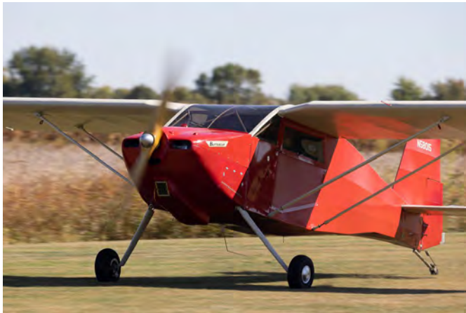
the Buttercup on its' takeoff roll on runway 27.