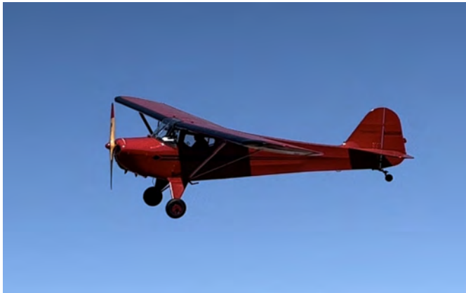
Marty flying a photo pass in the Taylorcraft