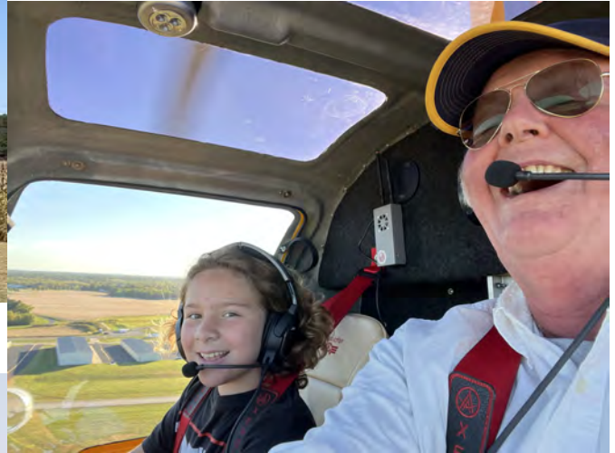
another Young Eagles' flight in the Gyro