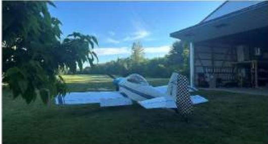
Looks like no more breakfasts at home!