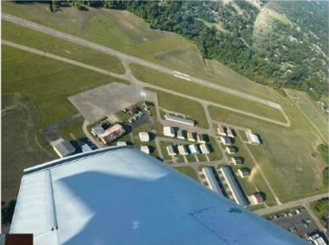
One more young eagle got to fly in the RV4.