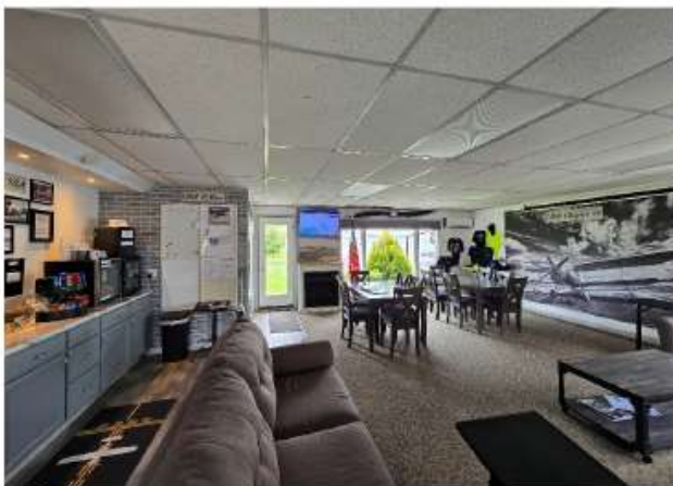
Hinde Field Airport (88D)