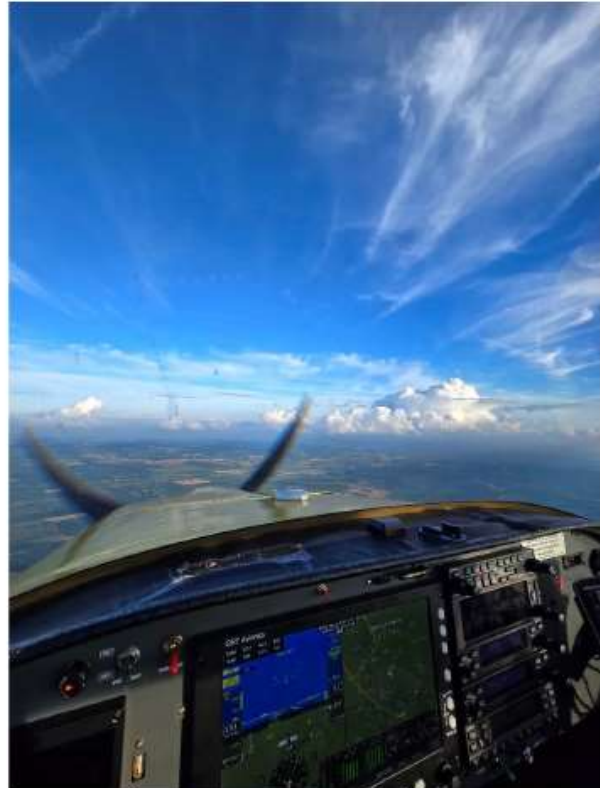
Navigating around the pop-ups