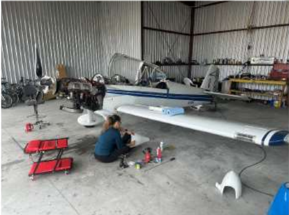
Condition Inspection done with some pre-Oshkosh tune up. Prop dynamically balanced to almost no vibrations