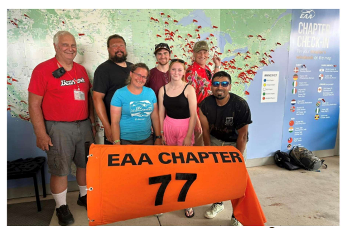
Hope this picture keeps getting crowded every year 😊