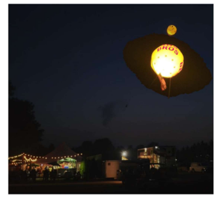
Dinner sos Bros Beer Tent what happens in OSH stays in OSH