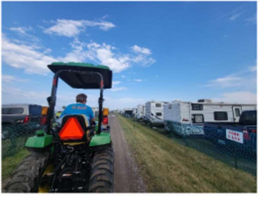
THANK YOU To the awesome volunteers