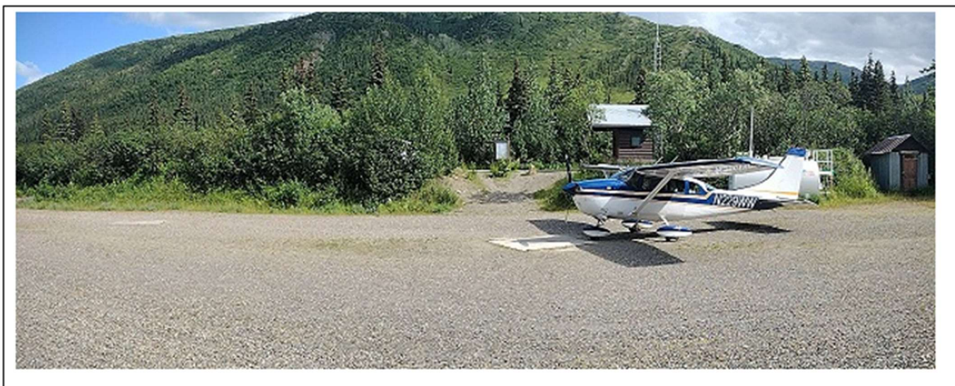
Panoramic view while waiting for guests at 5Z5. Note the plywood pads under the prop which helps prevent stone nicks.