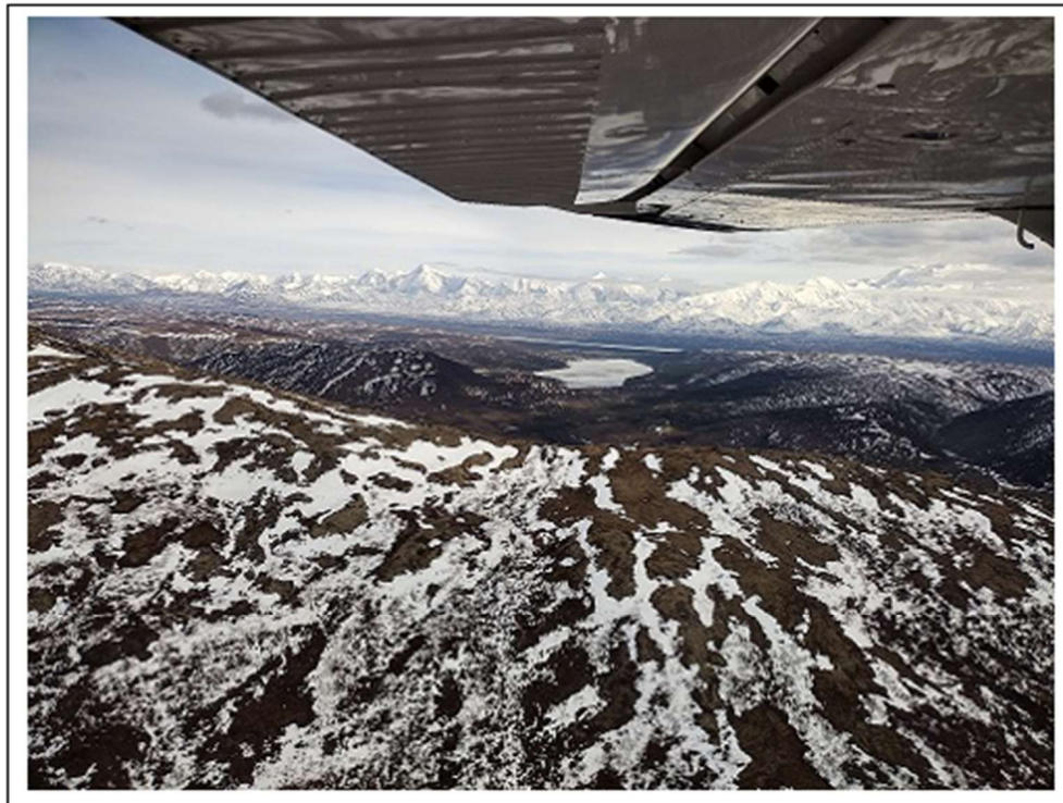
Wonder Lake just SE of my typical destination – Kantishna (5Z5) – with the mountains just East of Denali