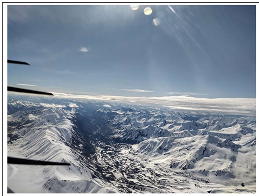
Returning to base, Denali Private (AK06), following 'The Trench'. View is NE from about Anderson Pass. Pacific Geological Plate on the right and the North American Plate on the left.