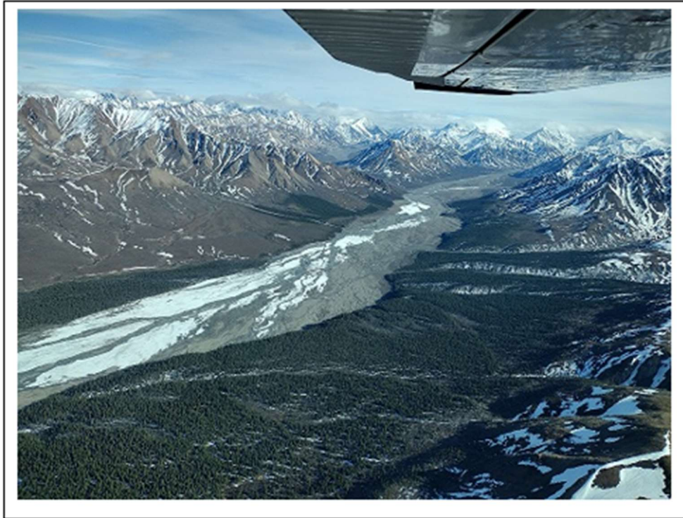
Toklat River – Looking south towards the Alaska Range from Mt. Sheldon area.