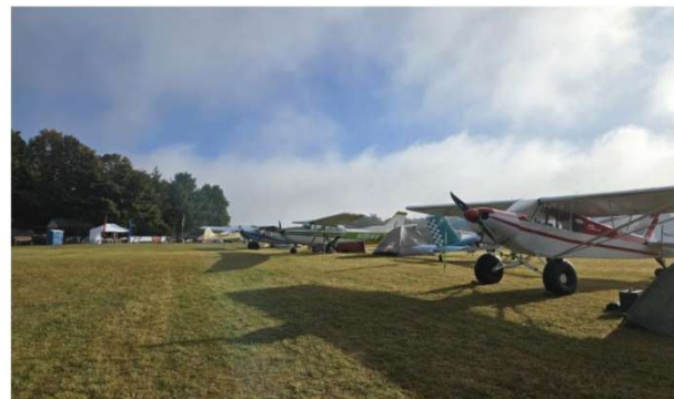
Spot landing trophies