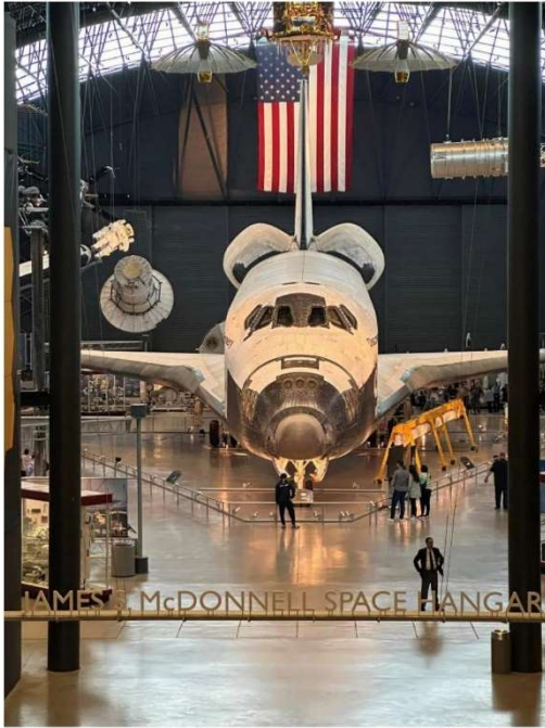
Air & Space Museum, Chantilly, VA