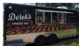
Derek's Curbside Grill