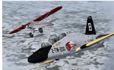
Photo of Virtual EAA Chapter 766 March Meeting