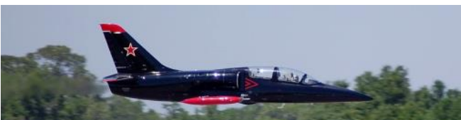
Dale Snodgrass flying the Aero L-39C Albatros at the 2011 SUN n FUN Aerospace Expo in Lakeland, Florida.