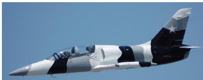
Dale Snodgrass flying with the Black Diamond Jet Team at the 2011 St. Augustine Air Show in St. Augustine, Florida.