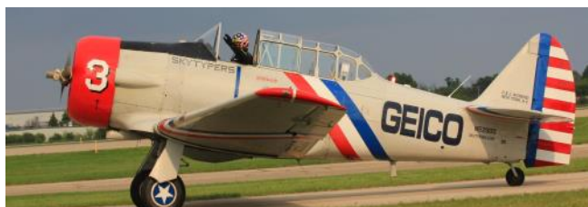
Andy Travnicek performing with the GEICO Skytypers Air Show Team at the EAA AirVenture Oshkosh 2021 air show