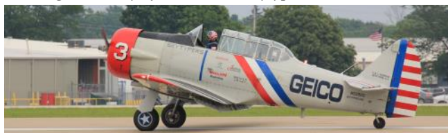
Andy Travnicek performing with the GEICO Skytypers Air Show Team at the EAA AirVenture Oshkosh 2021 air show Image Courtesy of Adam Santic.