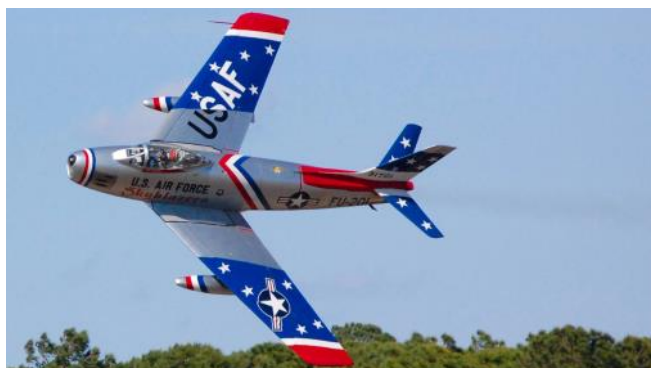
Dale Snodgrass flying the 1952 North American F-86F (N86FR) at the 2010 Tico Warbird Airshow in Titusville, Florida.