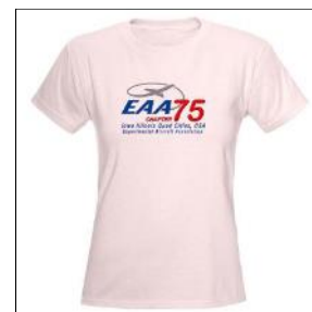
Men's Polo and Women's T-Shirt