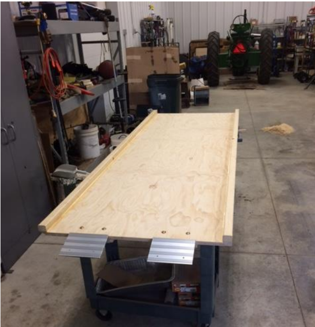
New Ramp for Use at the Repair Barn