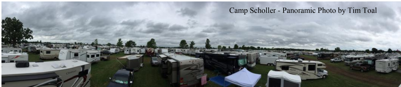
Camp Scholler - Panoramic Photo by Tim Toal