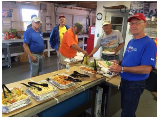
Italian Night at the Repair Barn