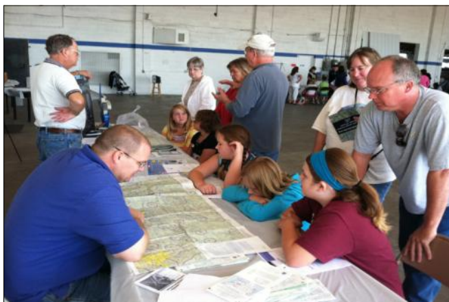
Learning flight planning and sectionals

Girls learned how the airport was operated and flight plans created, tested out a plane's control panel, learned about different types of planes, and tested out miniature planes they build themselves. They also had an opportunity to win a scholarship to the Oshkosh Air Academy for the summer of 2012 and were invited back for the Young Eagle Fly In set for October 15 th at the Davenport airport.