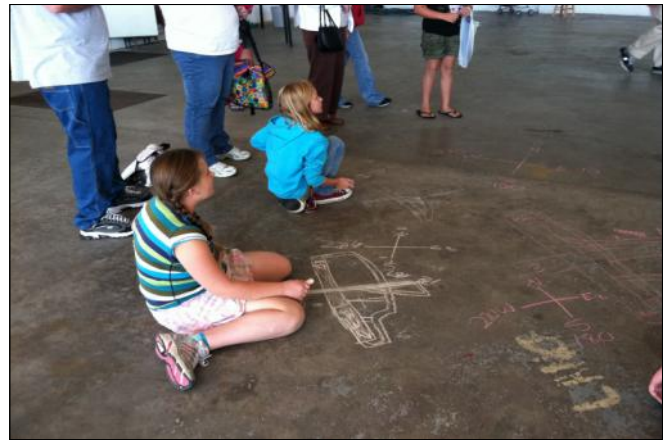
Drawing Airplanes and Runways on the Hangar Floor and a Classroom Session w/ the Experts