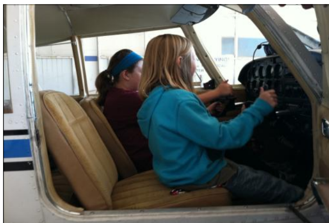
Learning the Functions - Yoke and Rudder Pedals

through a variety of ways, including joining a troop or group, attending a neighborhood activity center or summer camp or participating as an individual, in a program known as Girl Scout Juliettes.