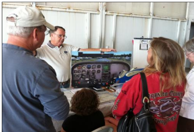
Aircraft Instruments and the Cockpit

Girl Scout programming focuses on five areas: healthy living, the environment, financial literacy, leadership and science, technology, engineering and math. Girls are able to participate in Girl Scouting