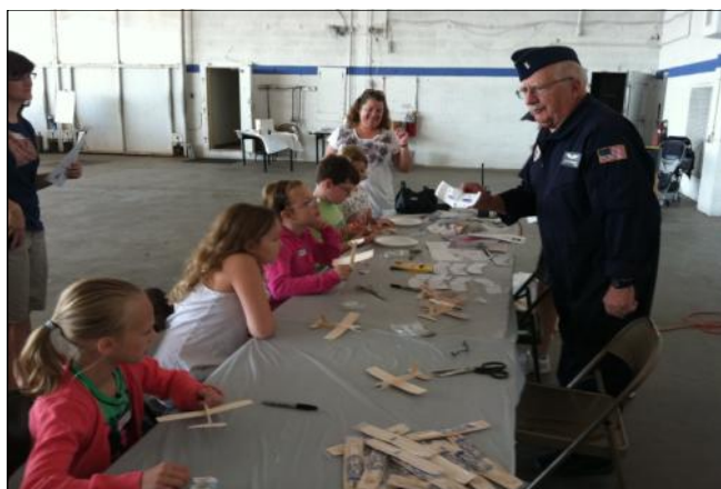
Making and Flying Their Own Airplane