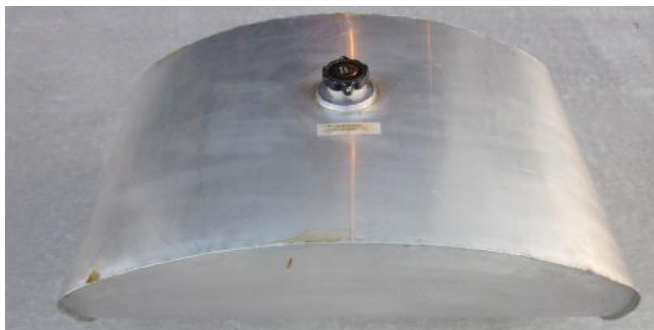
Falconar F-12 Cruiser 23-gallon fuel tank.