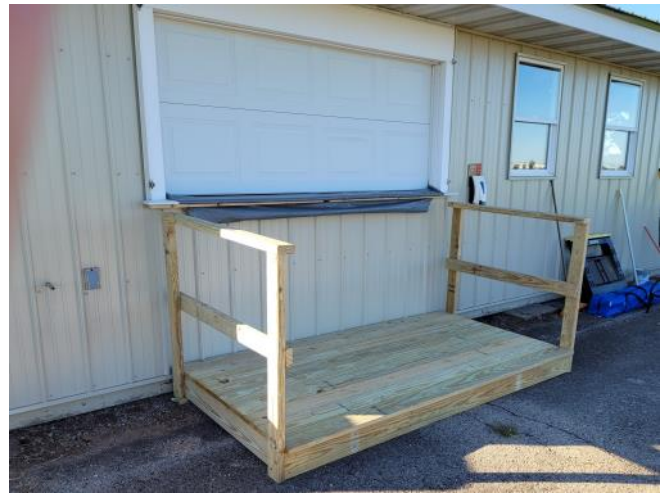
New deck at the tool check-out/check-in window.