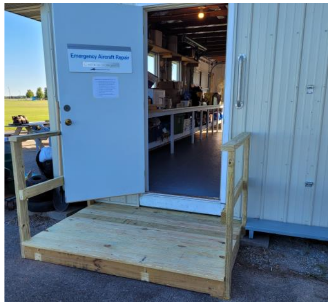
New deck at the north entrance.