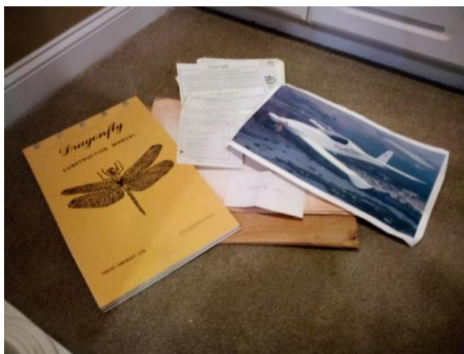
Viking Dragonfly Plans .

Compact, used, 720 channel aviation comm Transceiver in known-working condition. John Bruesch, 708-341-7083