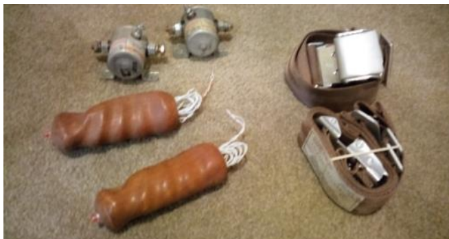
Pair of 24-volt 120-Amp starter or panel relays, pair of walnut contoured wood stick grips, and lap belts.