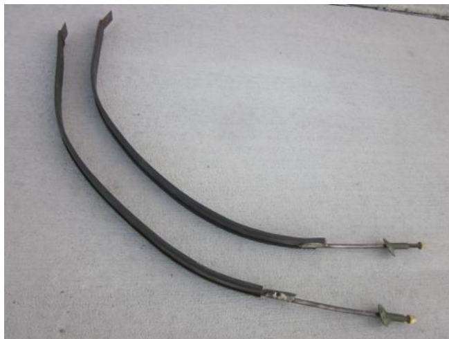
Mounting straps for fuel tank.