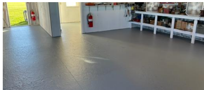
Newly painted floors.