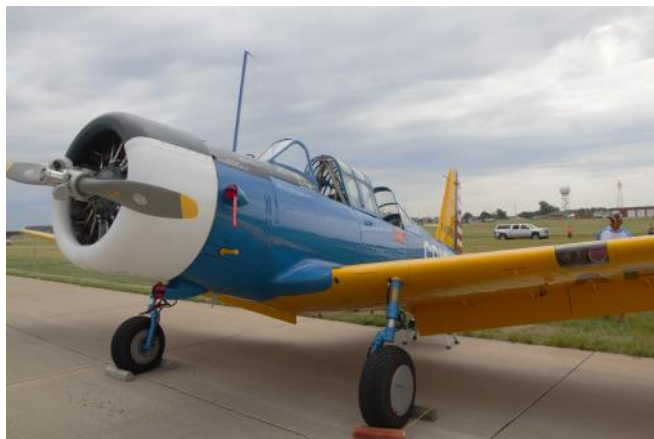
1941 Consolidated Vultee BT-13 Valiant (N52411) owned by American Airpower Heritage Flying Museum.