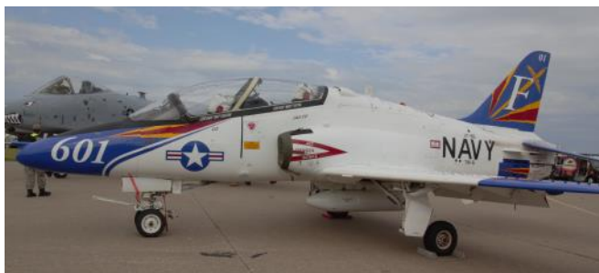
McDonnell Douglas T-45C Goshawk (163644).