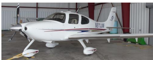
2007 Cirrus SR22 (N611JW) owned by Juliet Whiskey Aviation LLC.