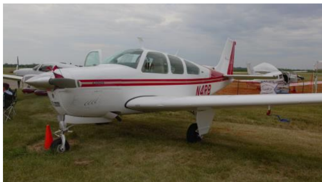
1973 Beechcraft F33A Bonanza (N4RB) owned by the Flying Country Club of the Quad Cities.