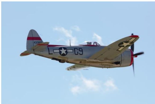
"Chief Ski-U-Mah II", formerly known as "Balls Out", a 1944 Republic P-47D Thunderbolt (N767WJ) owned by N767WJ LLC.