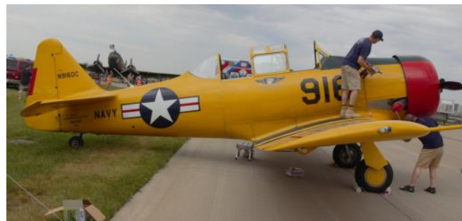
North American SNJ-6 Texan (N916DC) owned by the American Airpower Heritage Flying Museum Inc.