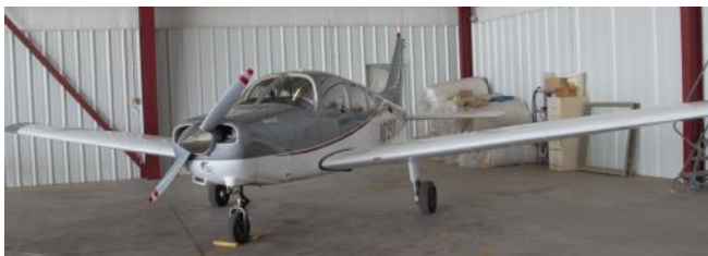
1980 Piper PA-28-161 Warrior II (N8191X) owned by Lima-001 LLC.