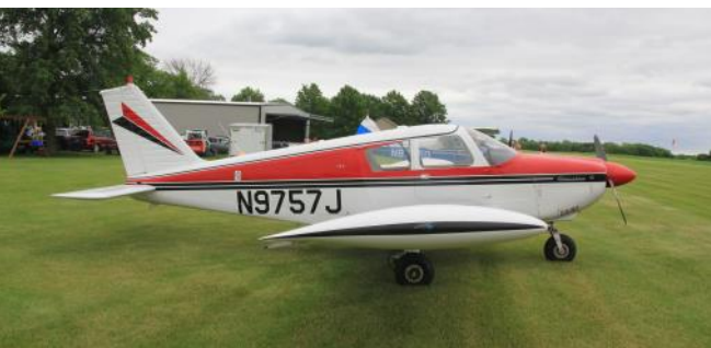
1967 Piper PA-28-180 Cherokee C (N9757J) owned by Diane Carbiener.