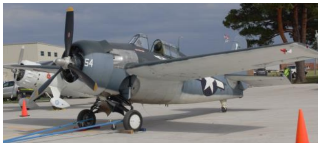
1986 Grumman FM-2 Wildcat (N5833) owned by the American Airpower Heritage Flying Museum Inc.