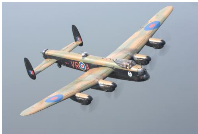
The Avro Lancaster Mk. X airborne over Oshkosh during EAA AirVenture 2006.

One of the rarest warbirds in North America and one of the most modern fighter jets in the Canadian Forces have been confirmed to participate during the Royal Canadian Air Force centennial at EAA AirVenture Oshkosh 2024. The 71 st edition of the Experimental Aircraft Association’s fly-in convention is July 22-28 at Wittman Regional Airport in Oshkosh, Wisconsin.