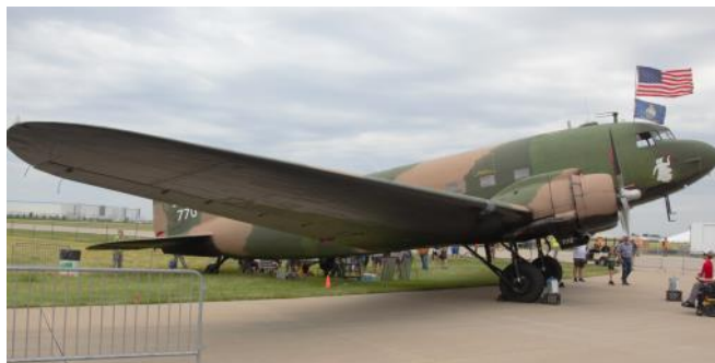
1944 Douglas DC-3C-R-1830-90C "Spooky" (N2805J) that closely resembles a Douglas AC-47 Spooky. It is owned by American Flight Museum Inc.