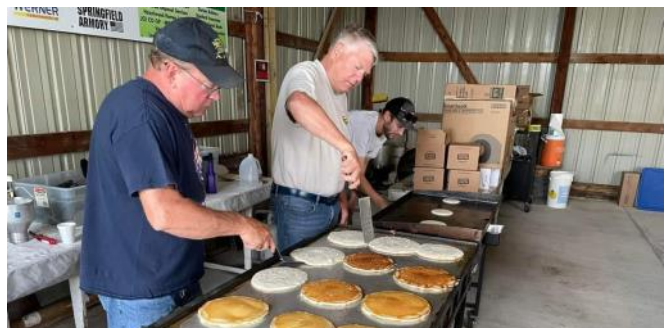
Gen-Air Serving pancakes.