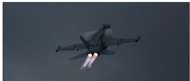
EA-18G Growler Demo Team.