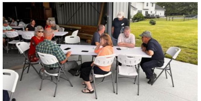
The crowd is enjoying a nice chat at the potluck event.