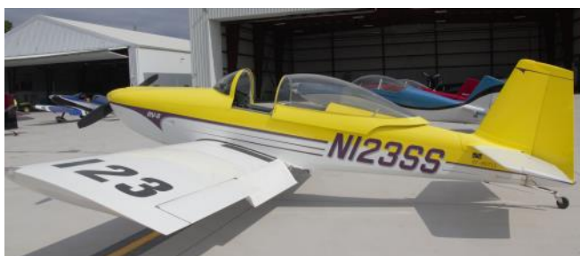
2002 Van's RV-8 (N123SS) owned by Schell Aerospace LLC.