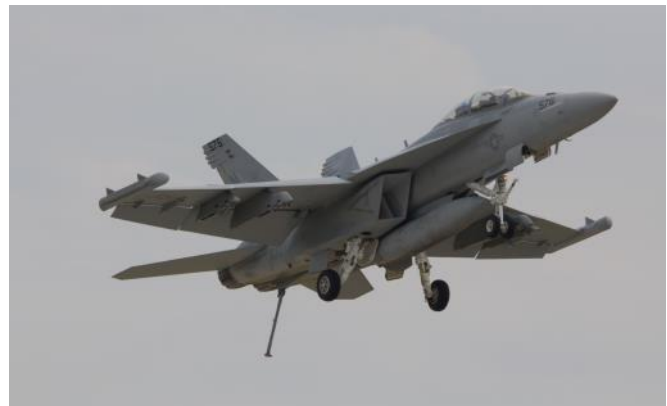
EA-18G Growler Demo Team.