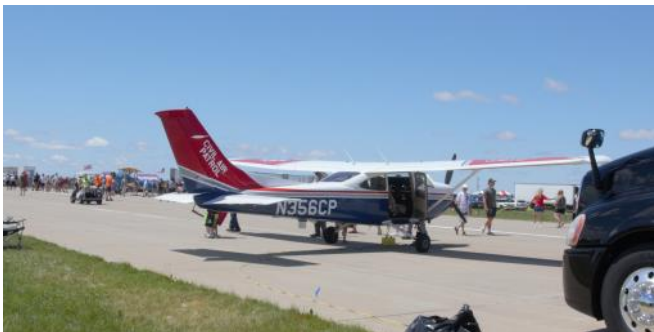
2005 Cessna 182T Skylane (N356CP) owned by the Civil Air Patrol.