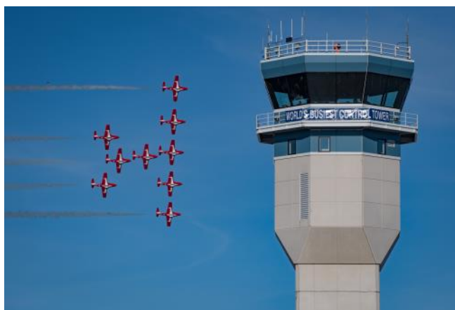
The Canadian Forces Snowbirds fly in formation past the Wittman Regional airport control tower during EAA AirVenture Oshkosh 2016.

The Canadian Forces Snowbirds , one of the most popular military aerial demonstration teams in the world, announced EAA AirVenture Oshkosh is part of their 2024 schedule, returning to Oshkosh for the first time since 2016.