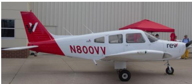
1981 Piper PA-28-161 Warrior II (N800VV) owned by Revv Aviation.