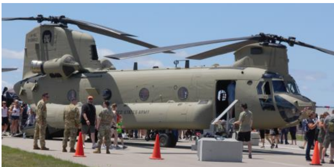
Boeing CH-47F Chinook belonging to Company B, 2nd Battalion, 211th General Support Aviation Regiment of the Iowa National Guard.