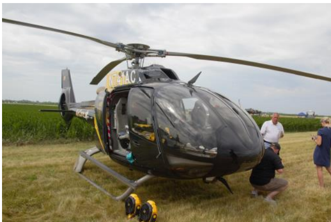
2014 Eurocopter EC130 T2 (N741AC) owned by Air Methods LLC.