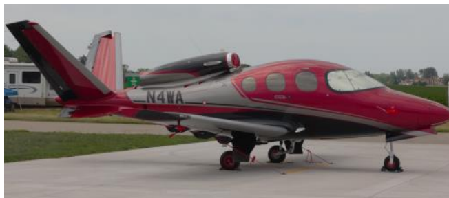
2002 Cirrus SF50 VisionJet (N4WA) owned by 54 Aviation LLC.