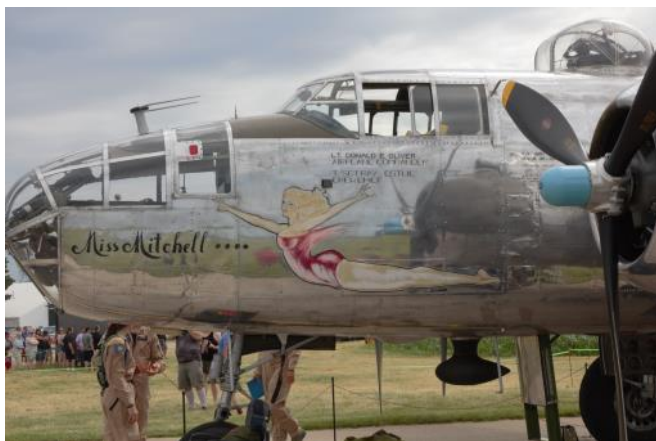
1944 North American B-25J Mitchell "Miss Mitchell" (N27493) owned by the American Airpower Heritage Museum.