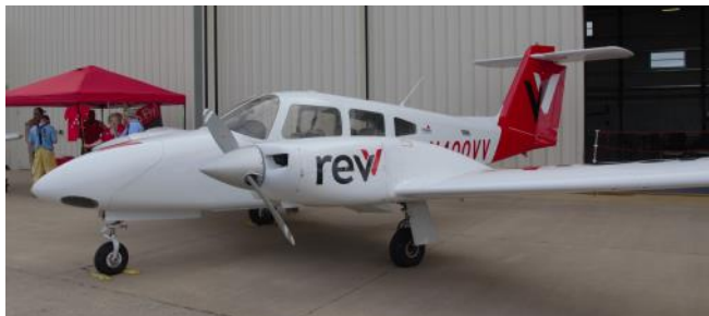
2001 PA-44-180 Seminole (N400VV) owned by Revv Aviation.