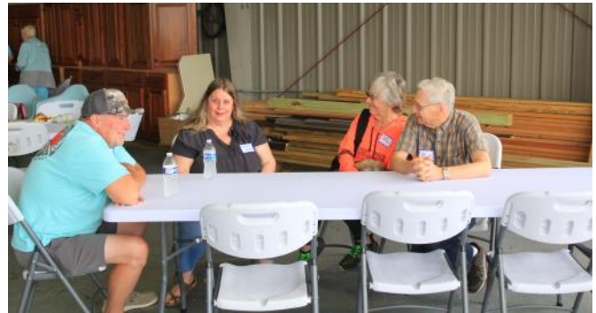
The crowd is having fun.