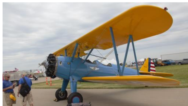
1943 Boeing E75 Stearman (N1631M) owned by American Airpower Heritage Flying Museum Inc.