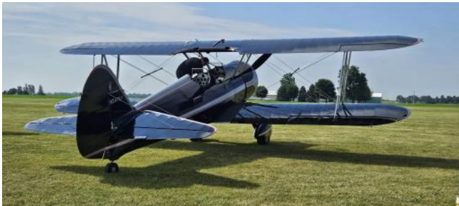
1943 Boeing B75N1 Stearman (N347KF) owned by Wolford Sales & Leasing LLC.