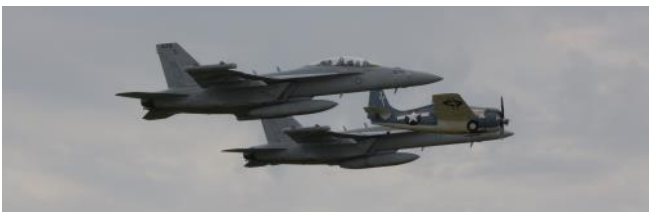
EA-18G Growlers & a 1986 Grumman FM-2 Wildcat

The United States Navy Legacy Flight performed at the show. On both days, it consisted of two Boeing