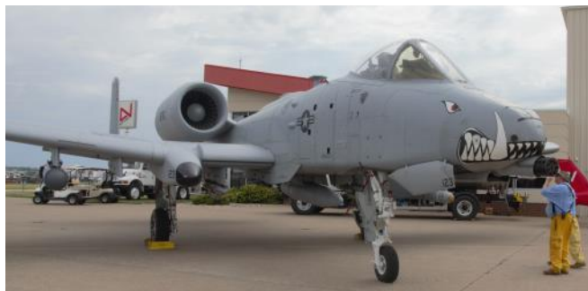
Fairchild A-10C Thunderbolt II (79-0123) of the 303rd Fighter Squadron, 442d Operations Group at Whiteman Air Force Base, Missouri.