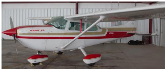
1997 Cessna R172K Hawk XP (N736WJ) owned by Lucky's Skyhawk LLC.