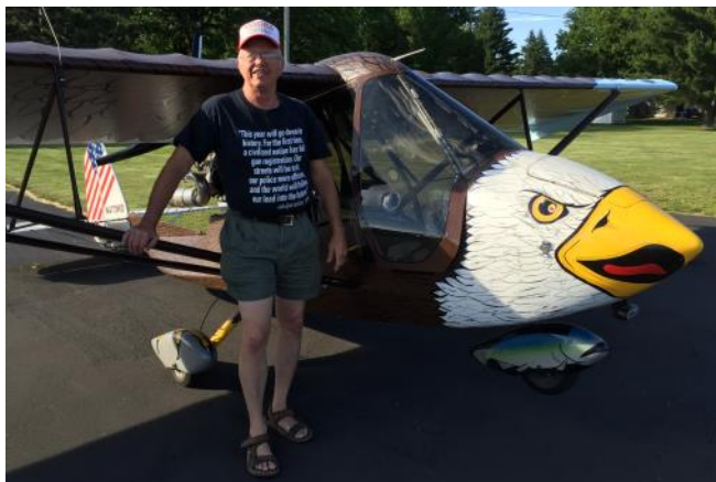
Winston's homebuilt 2012 Quad City Challenger II. Image Courtesy of the Rock family.