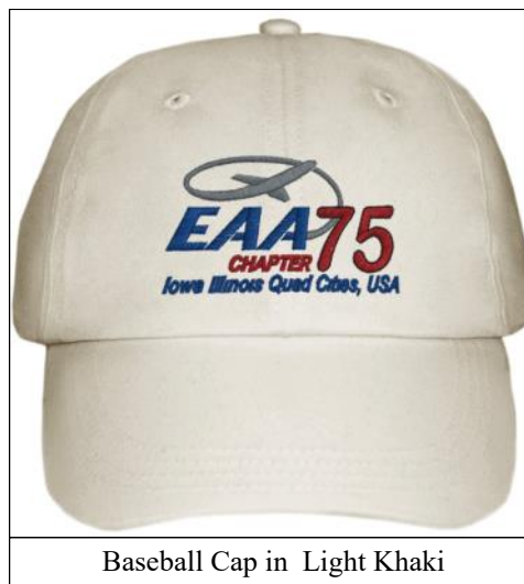
Baseball Cap in Light Khaki