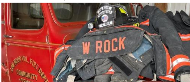
Winston served 47 years with the fire department.