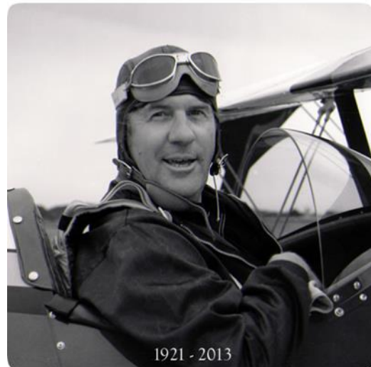
Paul Howard Poberezny 1921-2013 ( Click Here )