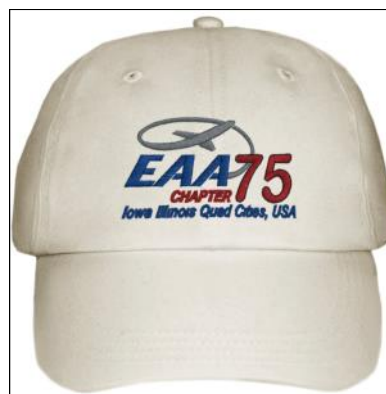
Baseball Cap in Light Khaki