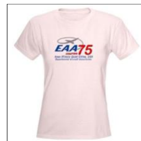
Men's Polo and Women's T-Shirt

card. Many items are available from CafePress ( www.cafepress.com ),