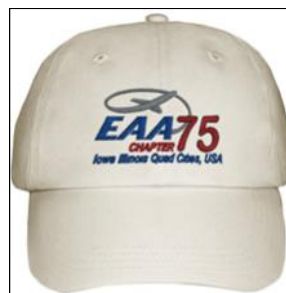
Baseball Cap in Light Khaki

You can visit the Chapter 75 store by going to www.cafepress.com/eachapter75 . All items are shipped directly to the buyer. All you need is a credit