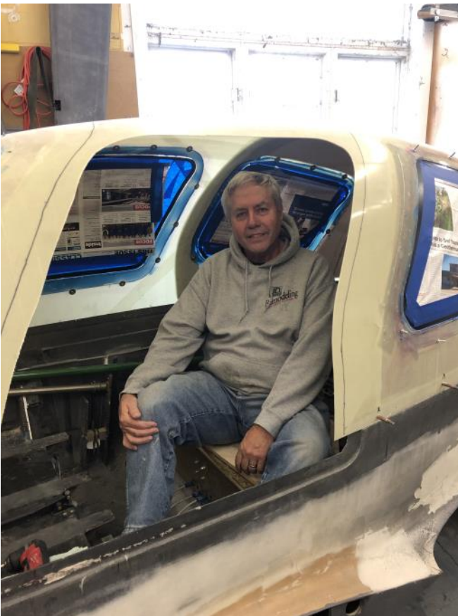
A FANTASTIC photo of the Lancair IV Guy!