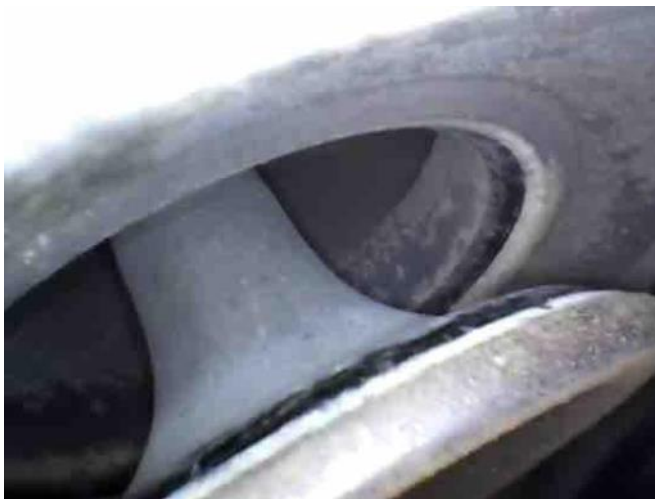
Photo of Jim Smith's Exhaust Valve Taken with the Articulating Borescope