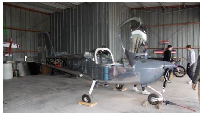
The student-built Van's RV-12iS plane is now located at the Davenport Municipal Airport (DVN/KDVN). This image was taken before its wings got reattached.