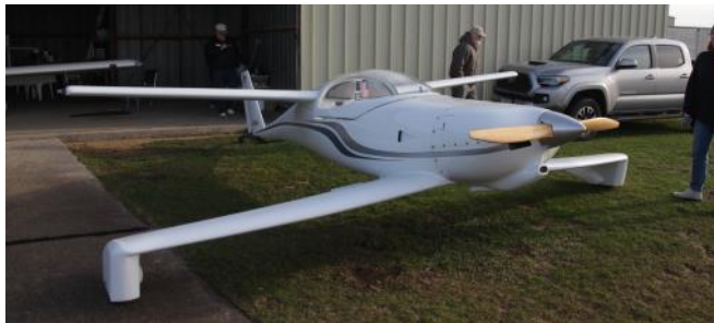
Paul Fisher's homebuilt 1990 Quickie Q-200 (N17PF).