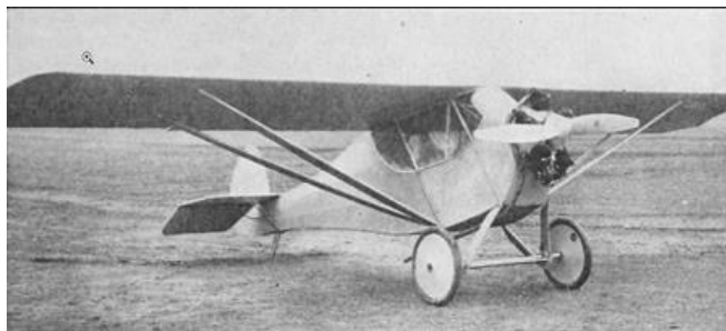
Photo of the Model 22 Central State Monocoupe, copyrighted by "Aeronautical Digest Publishing Corp." - Attribution: Reproduced from the fifth issue of Aero Digest Magazine, volume 10, issue 5, May 1927.

All aircraft that were available for purchase were subject to federal certification and required engineering analysis and testing prior to receiving an approved type certificate (ATC). The early Monocoupe (Mono 22 – ATC #22) was the first monoplane of its class to receive an ATC after passing a review by a degreed engineer.