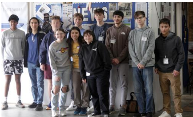
The fantastic PNB Aviation Club students who helped on this day!