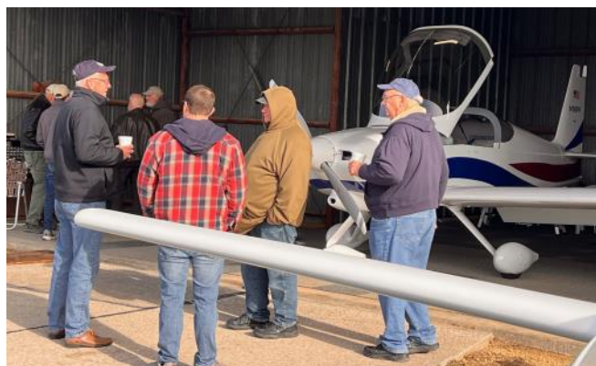
The crowd is having a blast.