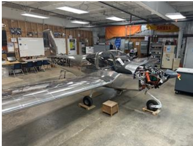
The plane at its build shop in Eldridge, Iowa.