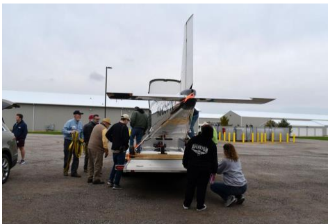
The PNB Aviation Club prepares to transport the club's newly-certified student-built Van's RV-12iS aircraft from Eldridge to the Davenport Municipal Airport on Saturday, April 19, 2025.

hands-on during the build phase has been transformative.