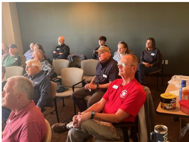
The attendees are enjoying the chapter gathering.