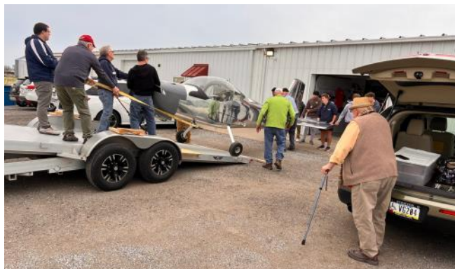
The loading the student-built Van's RV-is on a trailer for transport to the Davenport Municipal Airport.