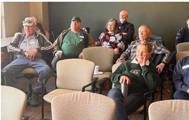
The attendees are enjoying the chapter gathering.

Location - Davenport Municipal Airport (DVN/KDVN)