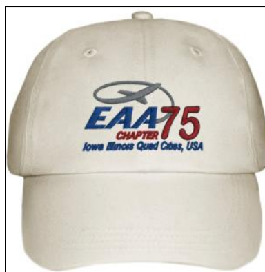
Baseball Cap in Light Khaki