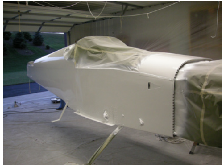
.....and after paint.