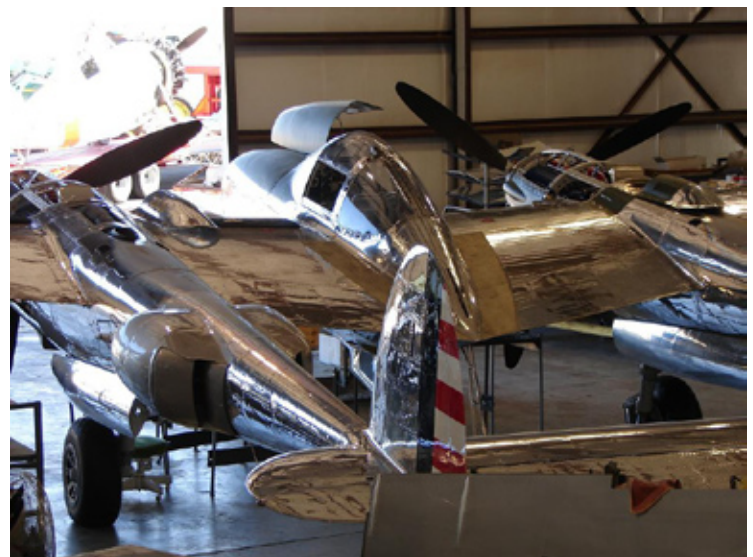
Not really a Chapter 75 Project, but it's still a beautifully restored P-38.