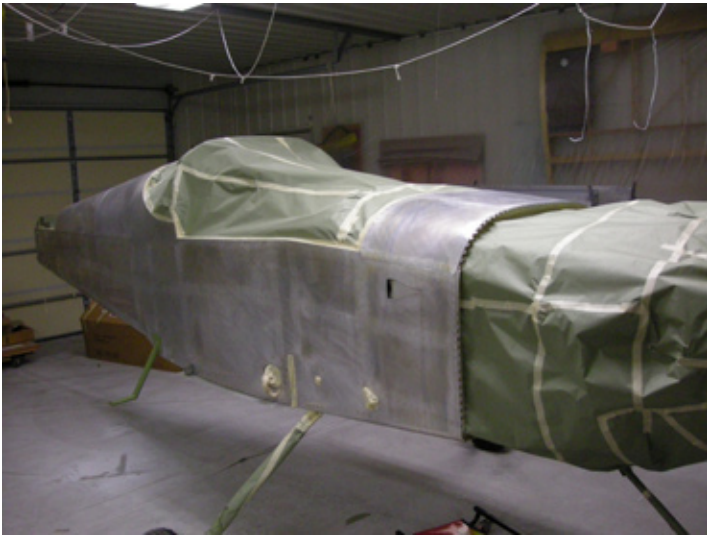
Paul's RV before paint....