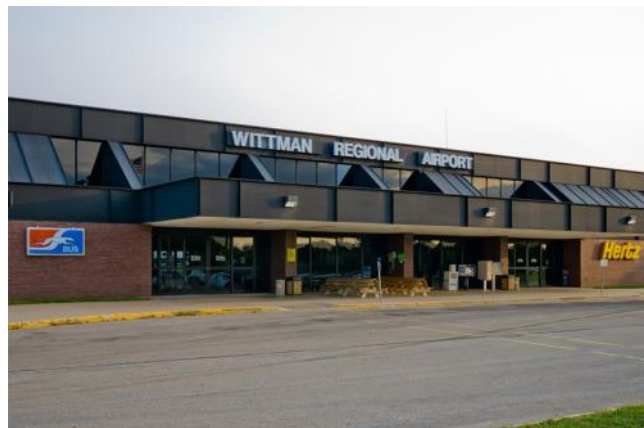
In this picture above is a picture of the old terminal at Wittman Regional Airport. This terminal broke ground in 1971 and then was demolished in 2020. In 2003, commercial airline service ended at this airport. This photo was taken on August 1, 2009.

On July 16, 2020, Wittman Regional Airport held a groundbreaking ceremony for the new terminal, with that structure being built to serve the general aviation community, including during EAA AirVenture. That facility will replace the current terminal and is expected to be in operation by next June.