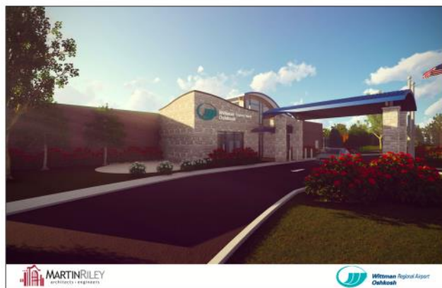
Above is a picture of the new building concept at a Wittman Regional Airport rendering.