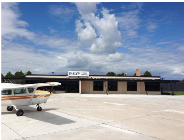
In this picture above is a picture of the old Basler Flight Service, a full service FBO facility located on the grounds at Wittman Regional Airport. This photo was uploaded to the Basler Flight Service's official Facebook Page on May 18, 2015.