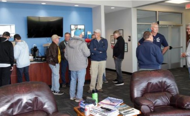
The attendees are enjoying the First Saturday Coffee and Donuts at Flight Deck Aviation.