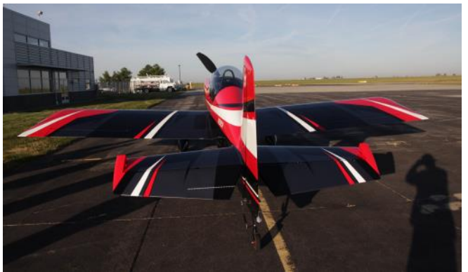
Tail view of Charlie Hammes' homebuilt, a 2023 Van's RV-8 Fastback (N208CH).