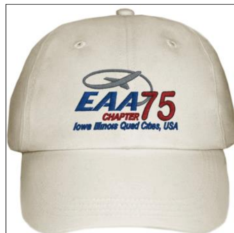
Baseball Cap in Light Khaki