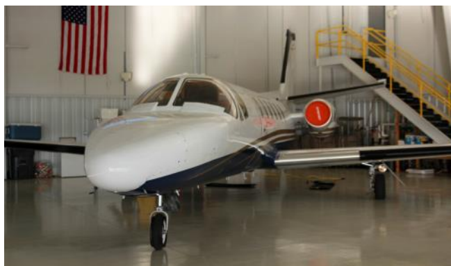
1981 Cessna 550 Citation II (N125RG) owned by NASEE LLC.