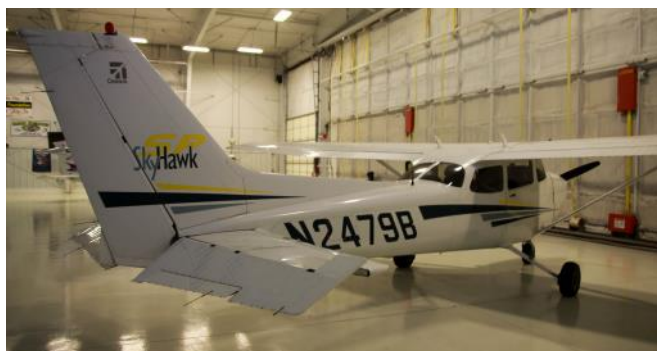
Flight Deck Aviation's 2001 Cessna 172S Skyhawk (N2479B).