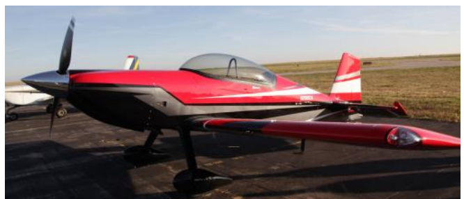
Left side view of Charlie Hammes' homebuilt, a 2023 Van's RV-8 Fastback (N208CH).