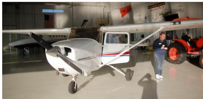
Flight Deck Aviation's 2004 Cessna 172S Skyhawk (N421RW).