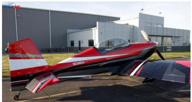
Right side view of Charlie Hammes' homebuilt, a 2023 Van's RV-8 Fastback (N208CH).