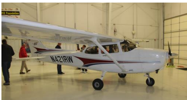
Flight Deck Aviation's 2004 Cessna 172S Skyhawk (N421RW).