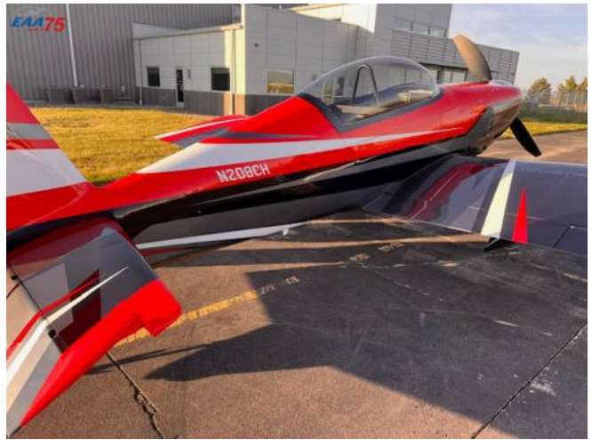
Right side view of Charlie Hammes' homebuilt, a 2023 Van's RV-8 Fastback (N208CH).