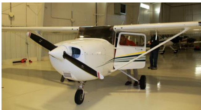
Flight Deck Aviation's 2001 Cessna 172S Skyhawk (N2479B).