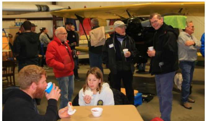
The attendees are socializing.