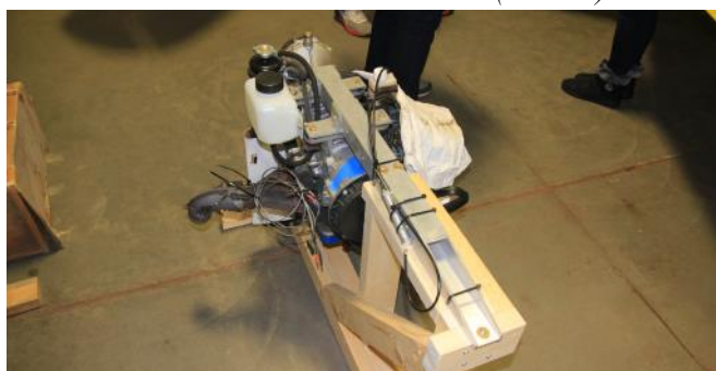
A engine for Ed Leahy's Airbike.