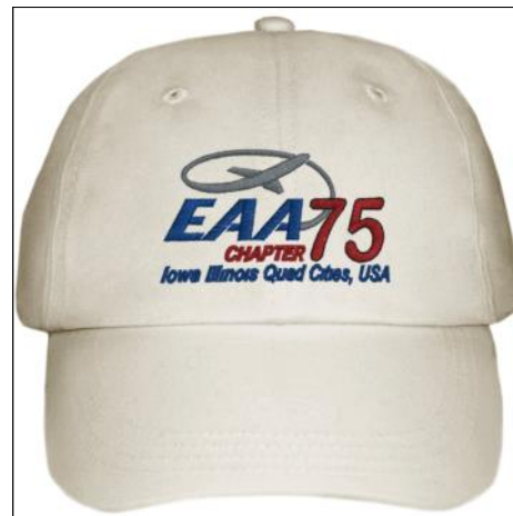
Baseball Cap in Light Khaki