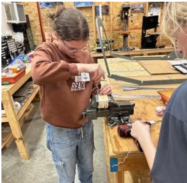
McKenzie and Kinze tapping canopy blocks.