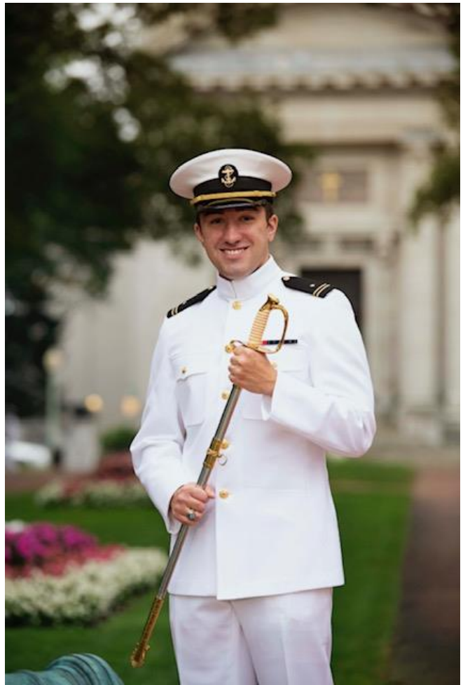
Commissioning Week/USNA graduation.