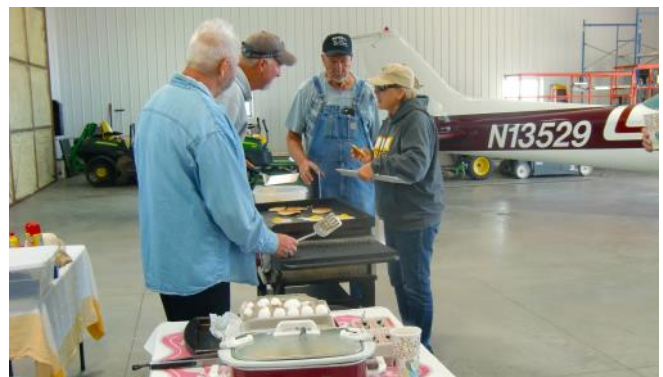
The cooks that cooked the wonderful breakfast.