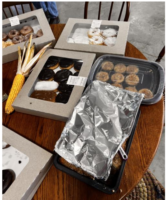
The food table featuring some yummy donuts.