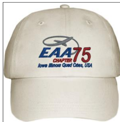
Baseball Cap in Light Khaki