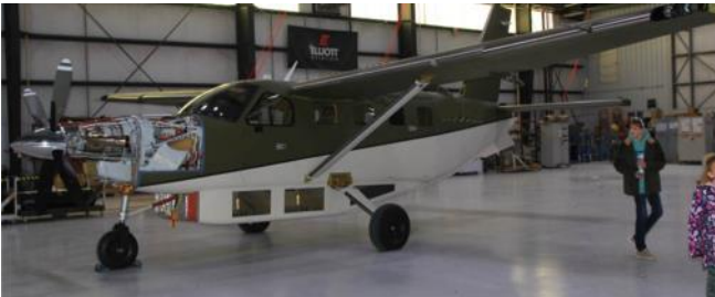
A Daher Kodiak 100.