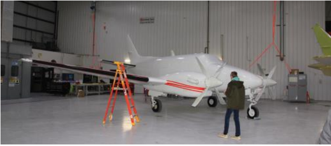
1994 Beechcraft King Air C90A.