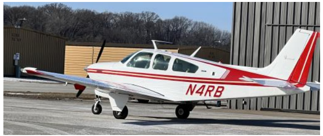
1973 Beechcraft F-33A Bonanza (N4RB) owned by the Flying Country Club of the Quad Cities.