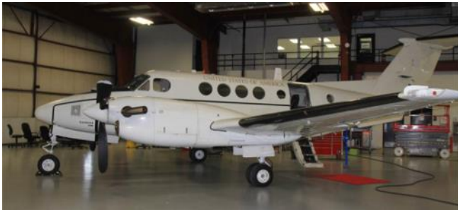
A Beechcraft C-12D Huron.