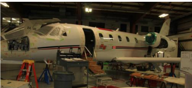
A 2000 Cessna 560XL Citation Excel.