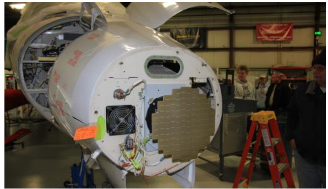
The employees at Elliott Aviation are hard at work.