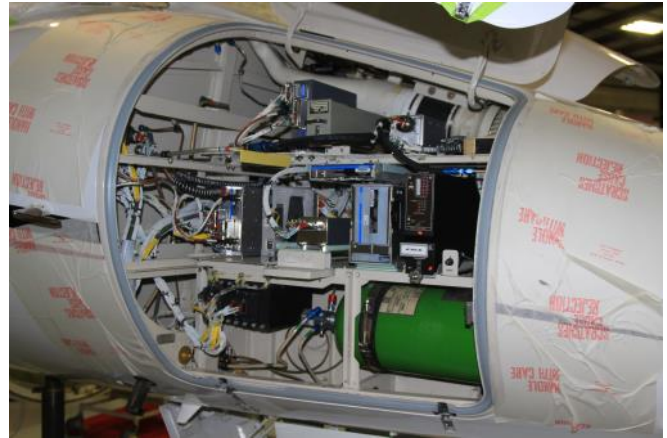
The employees at Elliott Aviation are hard at work.