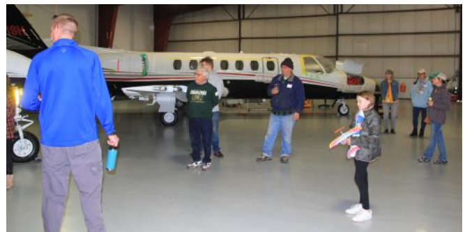
Elliott Aviation giving the attendees a tour of their facilities.