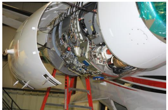
Engine work being done to a 2000 Cessna 560XL Citation Excel.