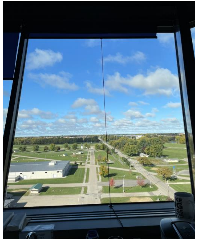
Inside look featuring the new large window panel.