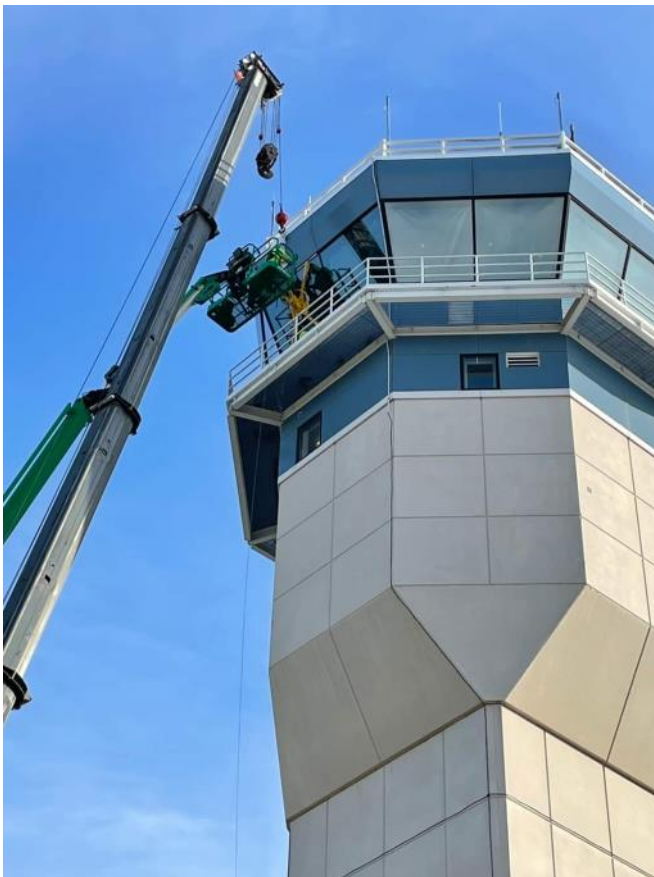
Work is being done to the air traffic control tower.

The second project included work being done by Omni Glass & Paint. They replaced two large window panels in the Air Traffic Control Tower cab due to cracking which had diminished the air traffic controllers visibility.