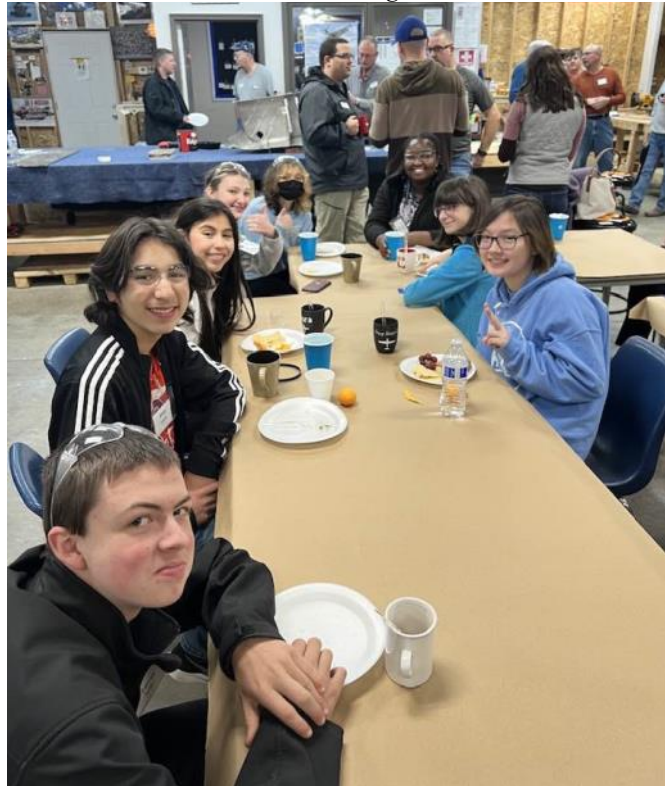
PNB Aviation student builders are posing for photos.