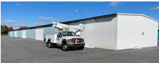
New paint is being applied to the north side hangars.