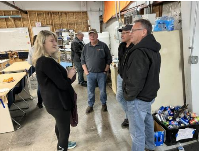
The attendees are having a great time.