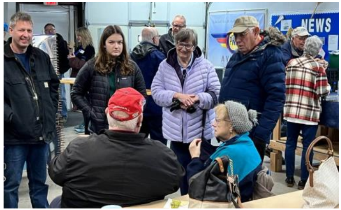
The attendees are having a nice chat.