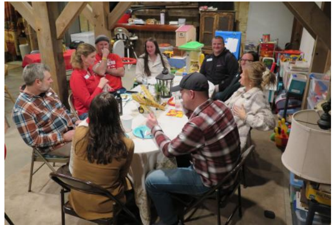
Guests are enjoying a nice meal.