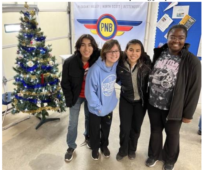
PNB Aviation student builders are posing for photos.