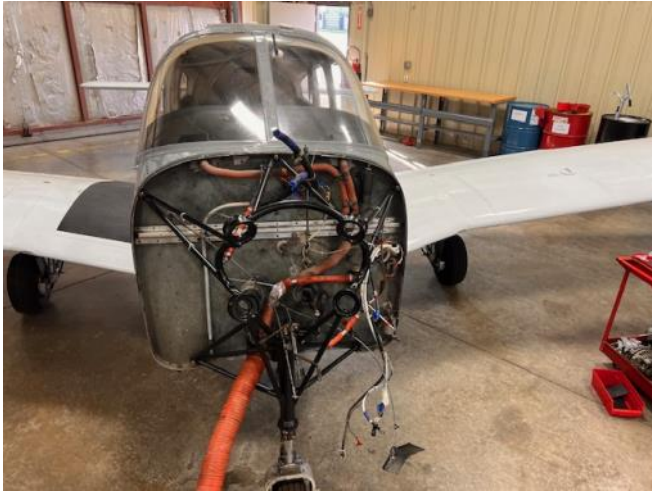
1980 Piper PA-28-161 Warrior (N8191X) with its engine removed.