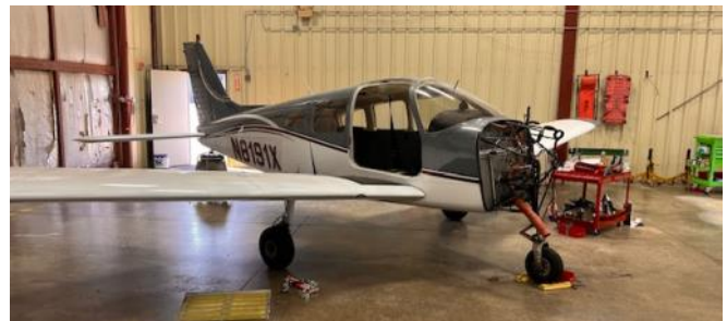
1980 Piper PA-28-161 Warrior (N8191X).