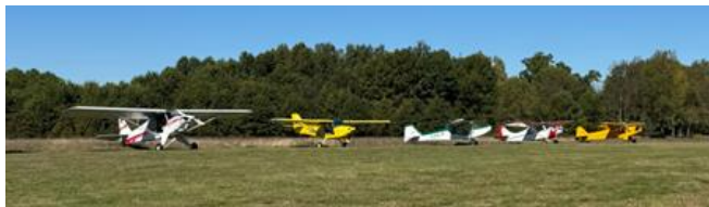
Certified and homebuilt aircraft above parked on the west side.

On departure to 68C we filed Instrument Flight Rules (IFR) and climbed out through a scattered layer to buck a 30 – 40 kt head wind. Upon arrival at the field, it had already started to fill up with airplanes, some of which are pictured here.