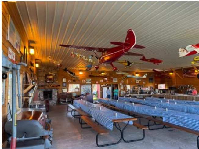
Central County Flyer Association's meeting location.

some Fridays, they do offer them. I can't advise going for lunch if you are on a diet as the portions are large and the desserts are irresistible. There were also a variety of drinks available. You will spend around $12.00 for lunch but it is really good homemade food.