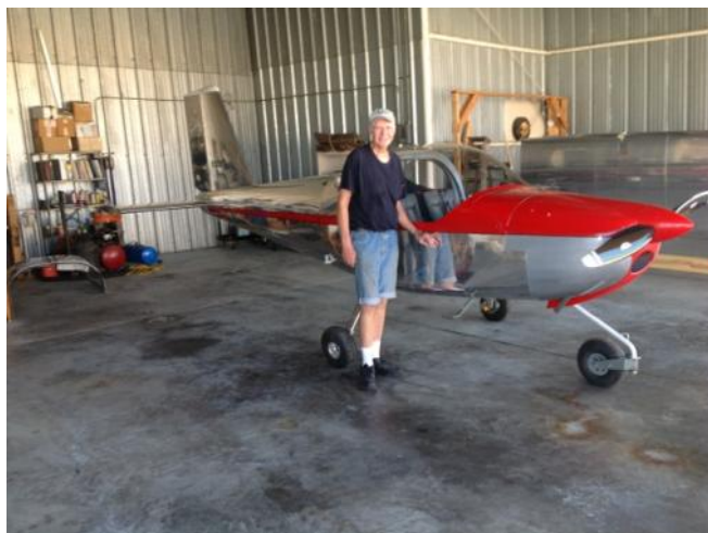
The Proud Owner!