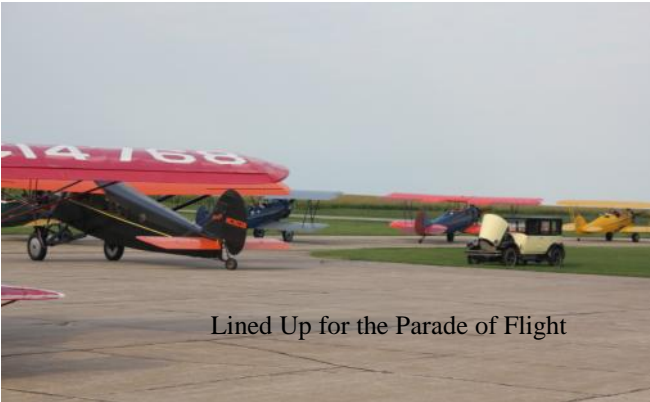
Lined Up for the Parade of Flight