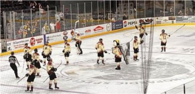
The Quad City Storm defeated the Peoria Rivermen in front of 3,618 fans to end their four-game losing streak against their in-state rivals.