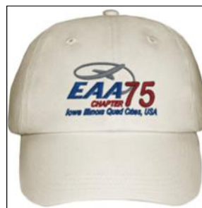
Baseball Cap in Light Khaki

You can visit the Chapter 75 store by going to www.cafepress.com/eachapter75 . All items are shipped directly to the buyer. All you need is a credit