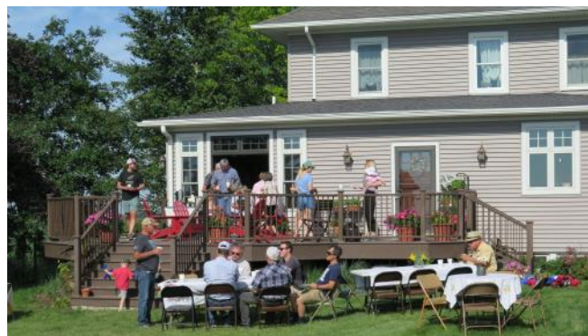
A nice turnout at the Meyer Farm & Airstrip.