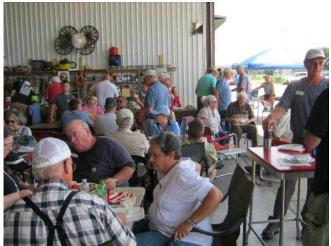
The crowd is having a nice chat and meal.