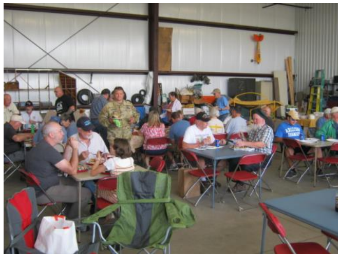
The crowd is having a nice chat and meal.