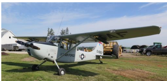
1951 Cessna 305A (L-19A) Bird Dog owned by the East Iowa Air Inc. (N5308G).