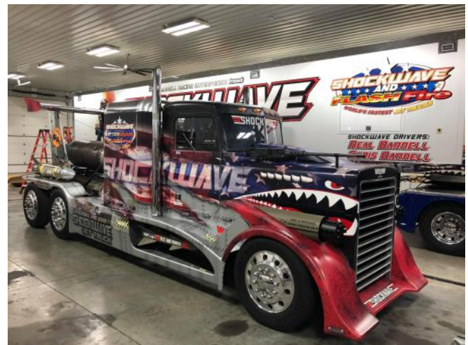
Top Gun Edition of Shockwave. This is an all-new military appreciation theme featuring a patriotic new wrap and all kinds of military artillery from all branches of the USA Military!