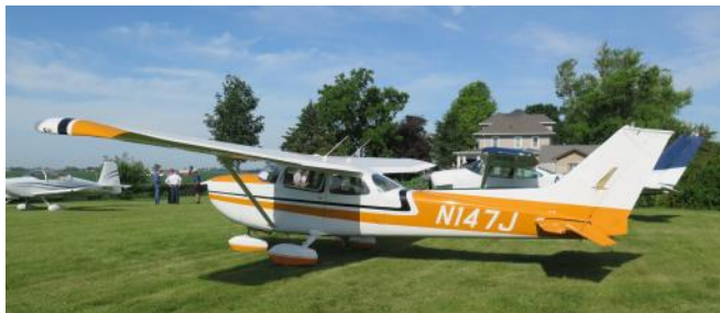
1973 Cessna 172M Skyhawk (N147J) owned by the Four Seven Jays Flying Club Inc.