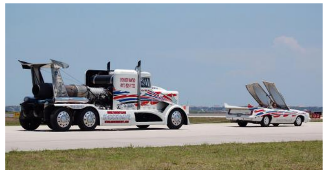
Shockwave at the 2011 Saint Augustine Airshow in St. Augustine, Florida.