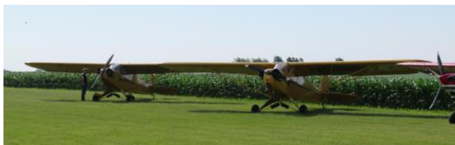
A pair of Piper JC-3 Cubs basking in the sunlight.