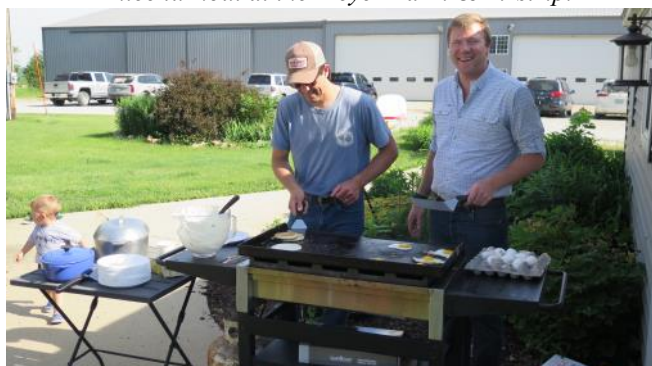
The cooks who cooked the delicious brunch.