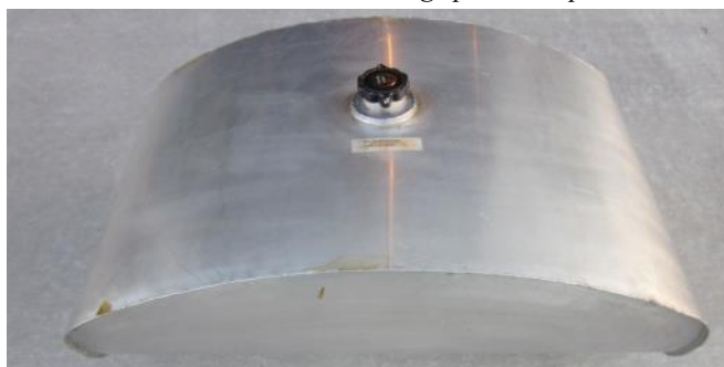
Falconar F-12 Cruiser 23-gallon fuel tank.