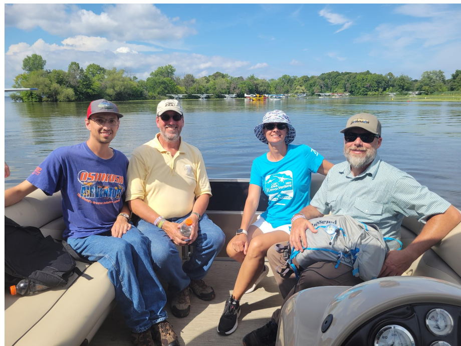
Boat ride at the Seaplane Base.