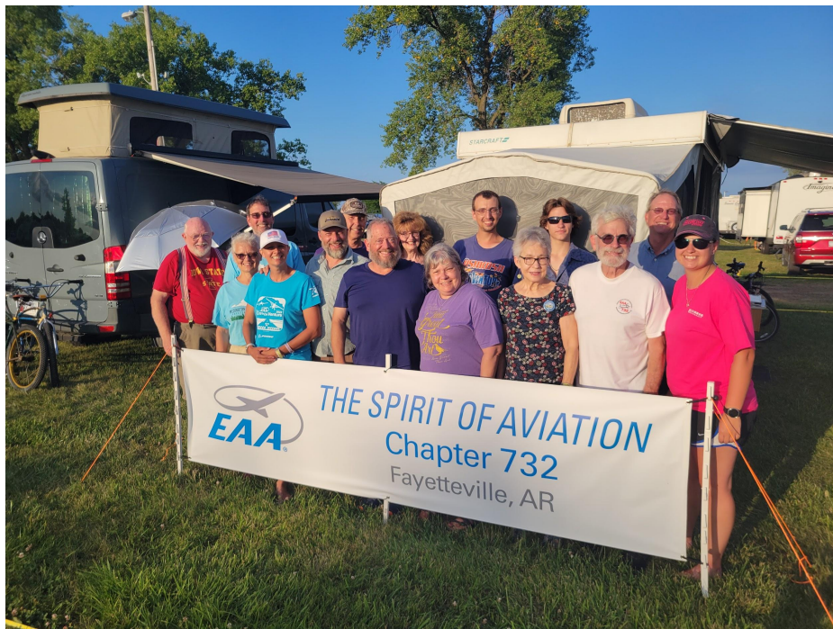
Chapter 732 campers: