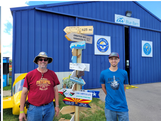
Our Chapter sign on top at the Blue Barn