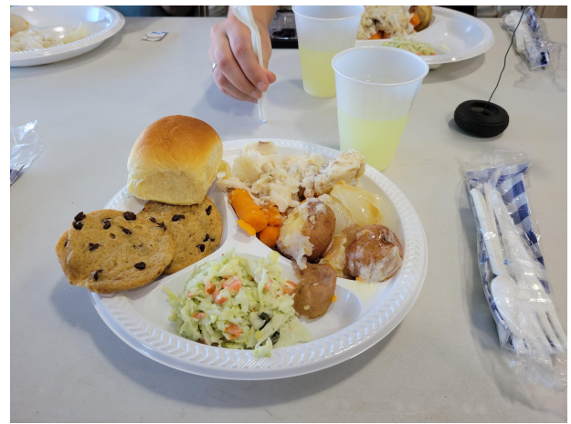
Friday night Fish Bowl