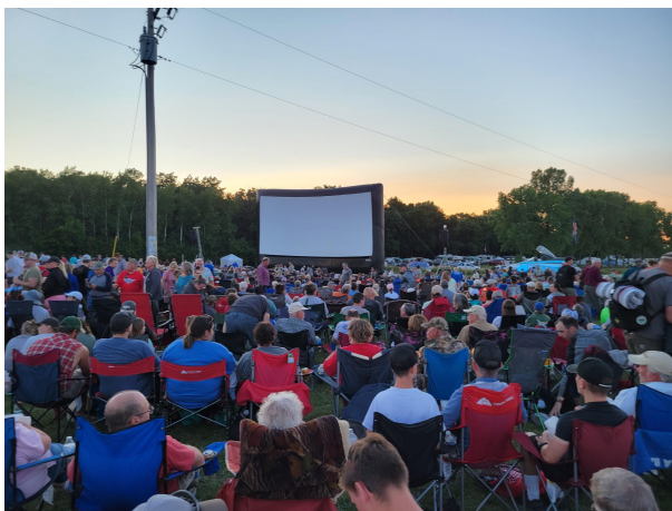
The crowd waiting for the showing of Top Gun Maverick.