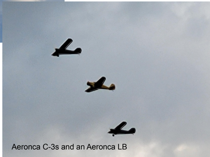
Aeronca C-3s and an Aeronca LB