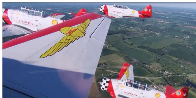
Getting a ride and hanging with the Aeroshell team!