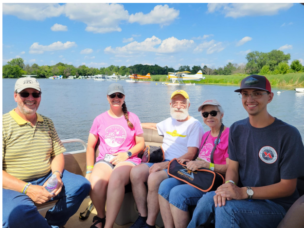
At the Seaplane Base