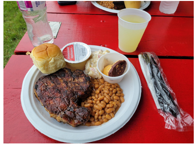
Saturday night Pork Chops