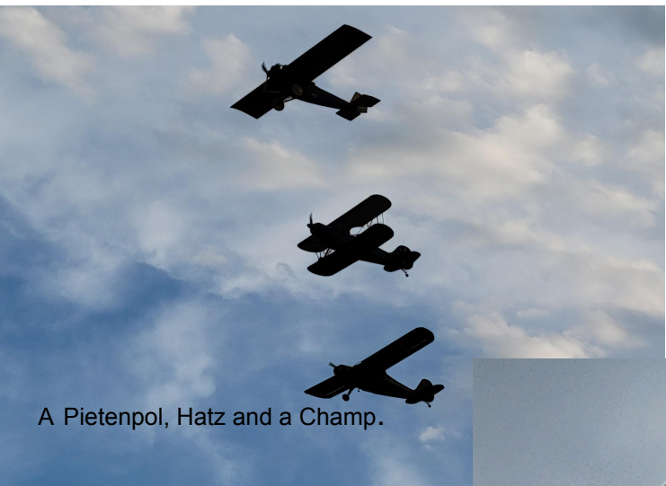
A Pietenpol, Hatz and a Champ.