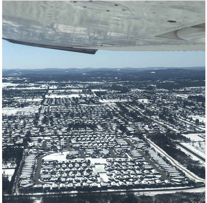
Bill Smith flying East from ASG on March 12th

HOTEL ACCOMODATIONS AVAILABLE AT DISCOUNTED RATE