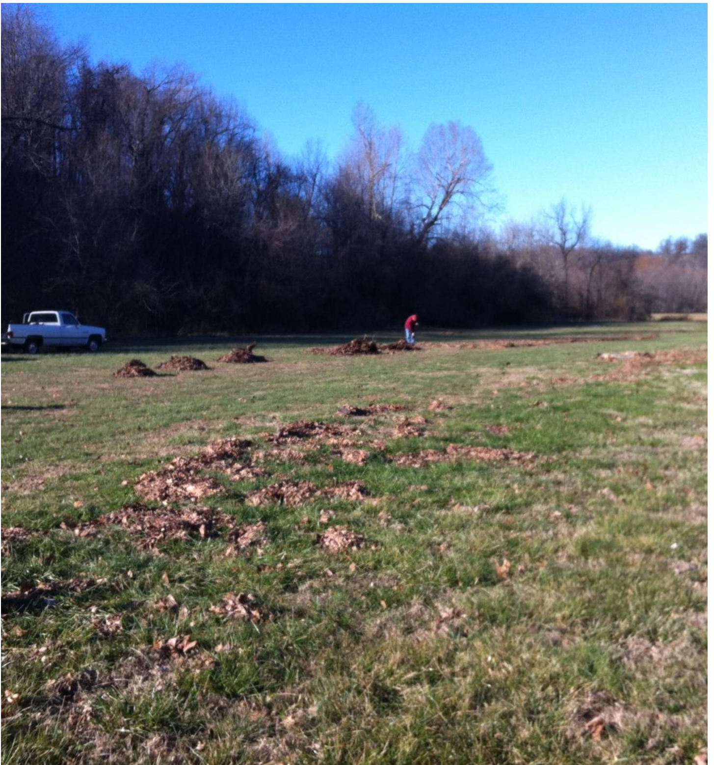
Clean up on Wedington Woods runway after the rain over Christmas weekend.