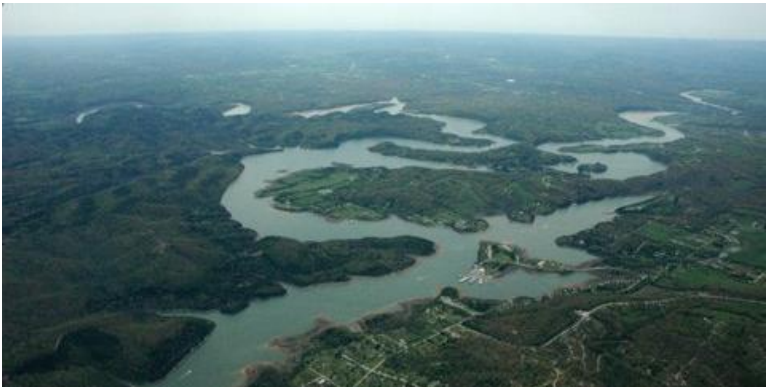
A view from Ellen Taylor's recent birthday adventure