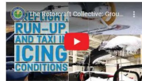
Helicopter Ground Operations in Icing Conditions - The Rotorcraft Collective