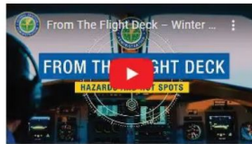
Winter Weather Challenges - From The Flight Deck