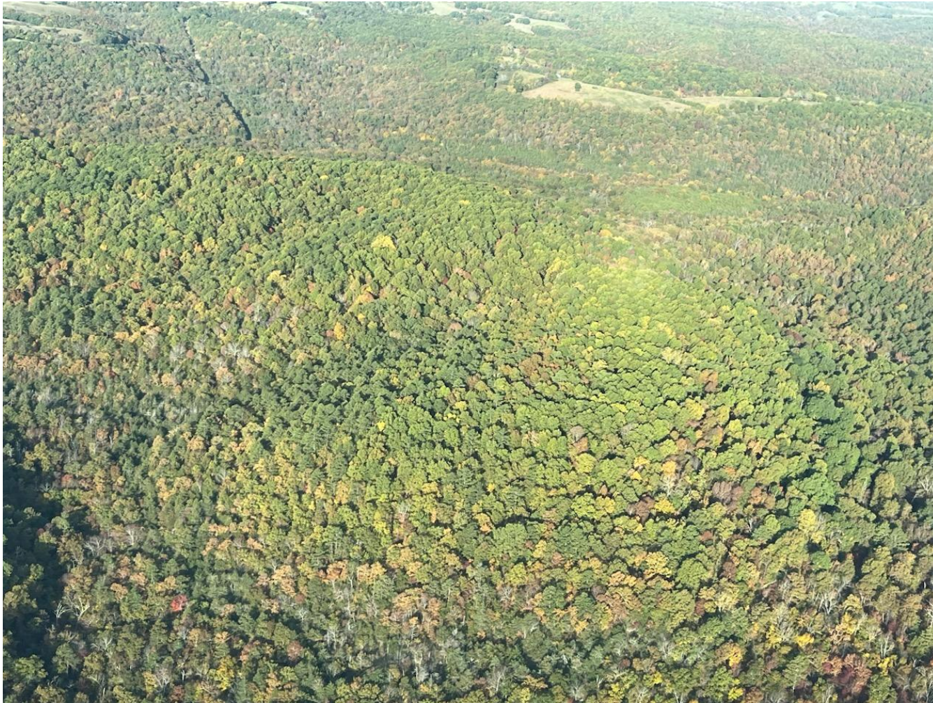
The Smith's flight to 4M1 October 21st.