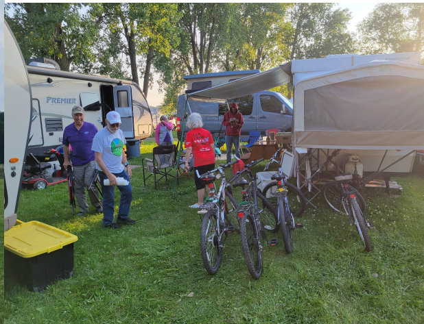
Part of our campsite at Oshkosh