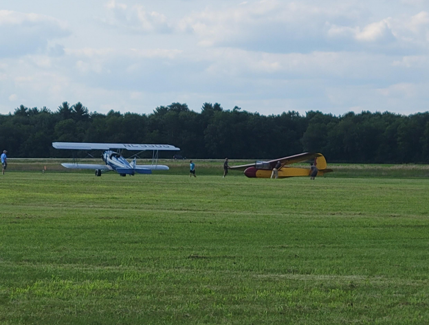
Only at Brodhead will you see a Travel Air biplane with a tail skid towing a glider!